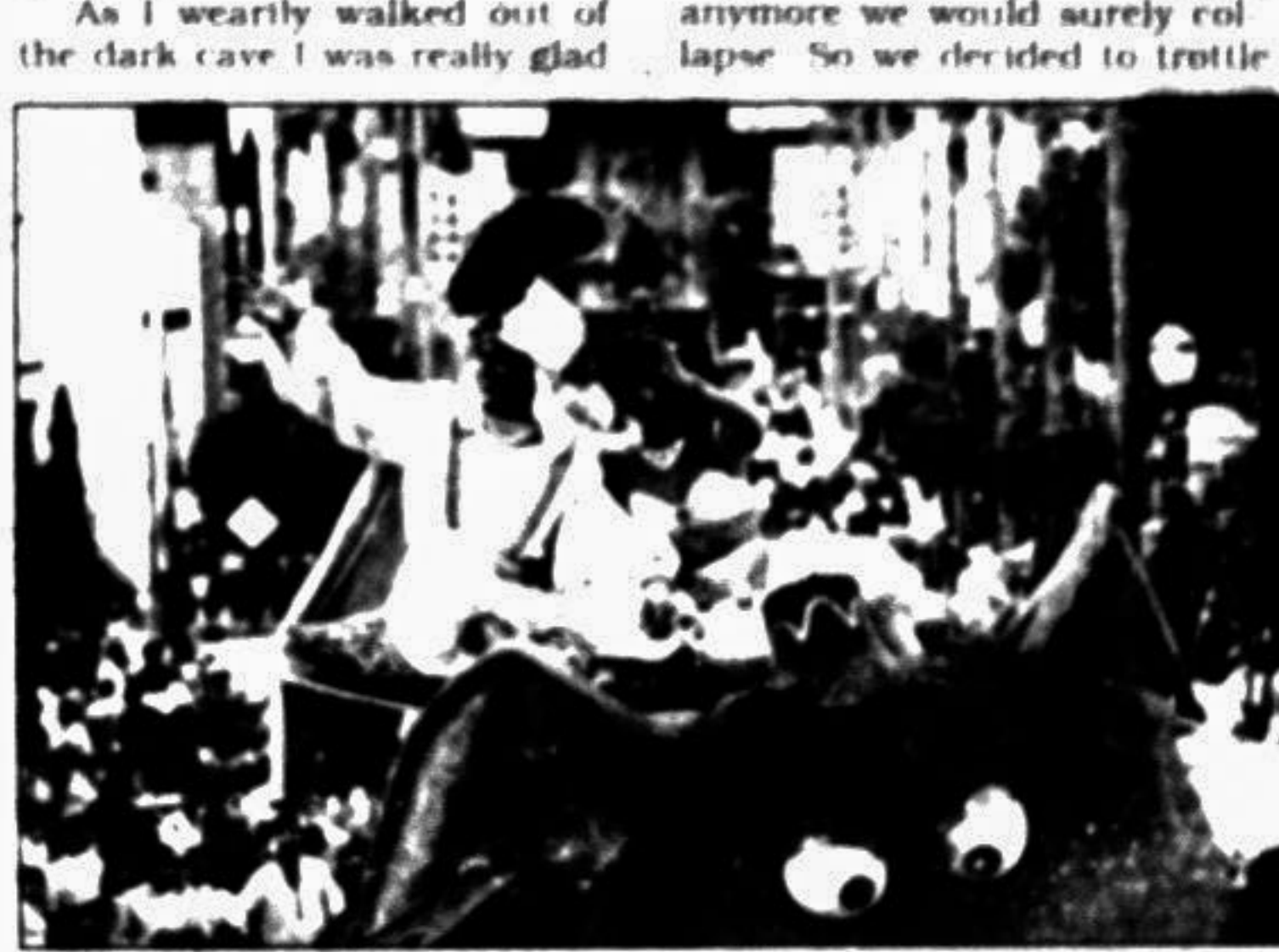
Where thrills are at every corner.

After a couple of common rides like the Merry Go Round and Spinning Tea Cups we realized that our legs were so dog tired that if we walked anymore we would surely collapse. So we decided to trol-