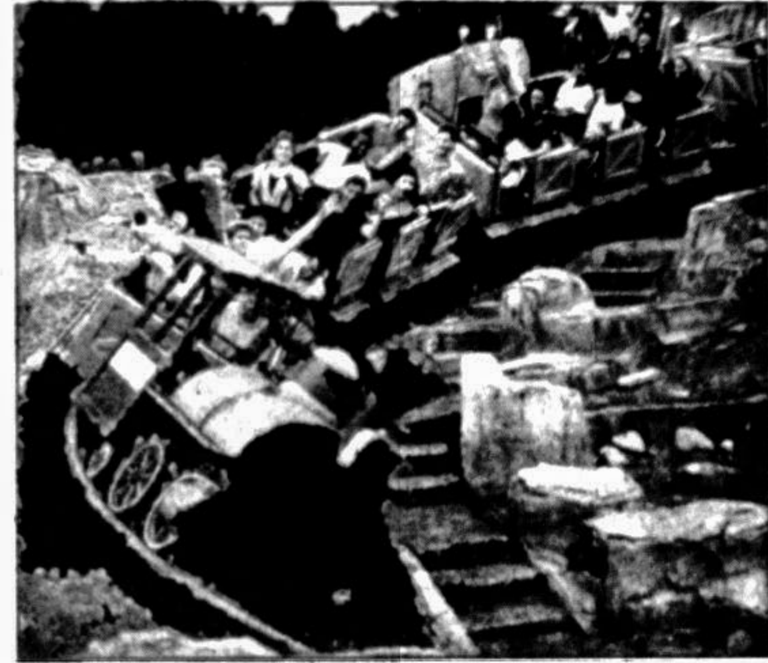
A world of wonder and fantasy.

I never really liked slow boat rides that much, but this exceptional ride was one of my favourite rides. To start off this boat was designed as if it was made in the late 19th century and to give it some more real-