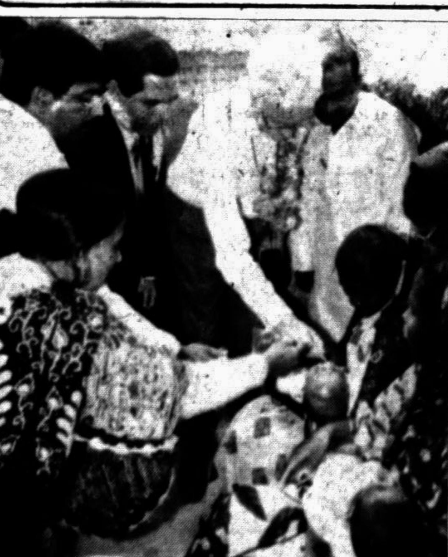
The British Secretary of State for Foreign and Commonwealth Affairs, Douglas Hurd, feeding polio vaccine to a child under the Mother and Child Health and Family Welfare Programme under the BRAC at Parbatipur January 4.

Her qualkhwani will be held on January 8, Sunday, after Asr prayers at her 278/2, Elephant Road residence in the city.