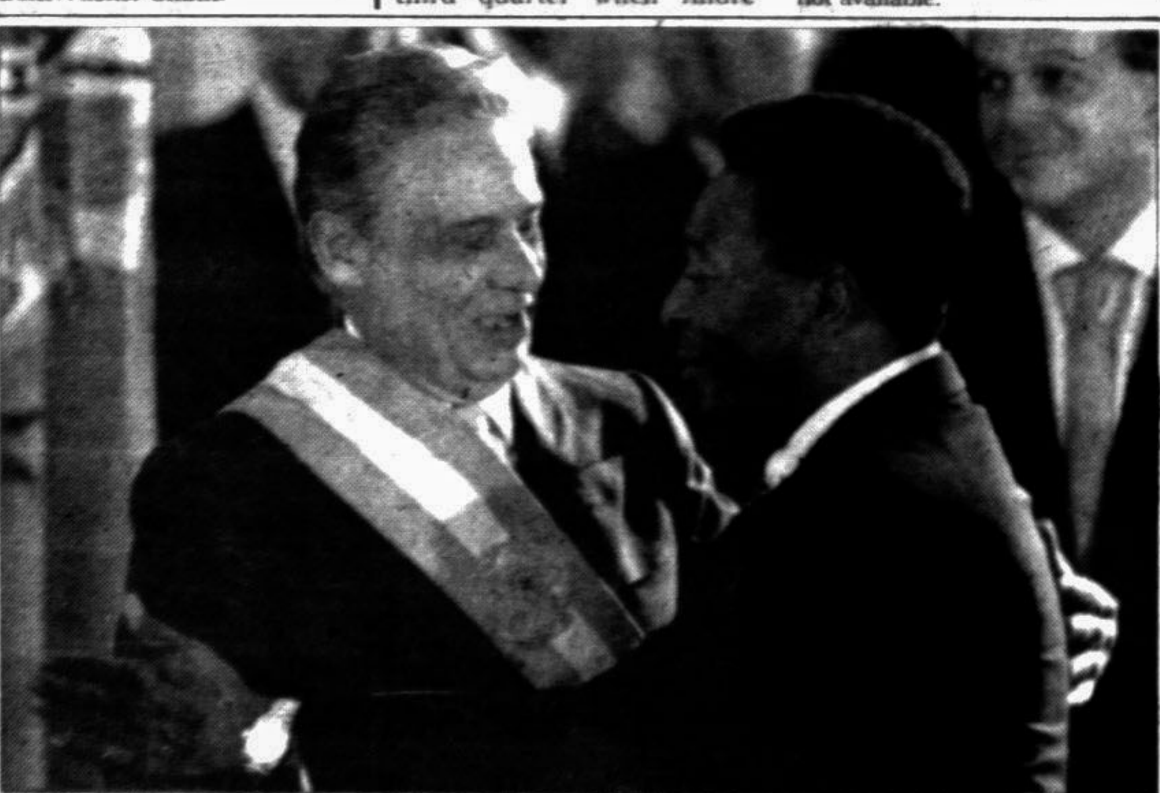
Brazilian President Fernando Henrique Cardoso (L) is congratulated by Minister for Sports Pele during Cardoso's inauguration ceremony in Brasilia on Jan 1.