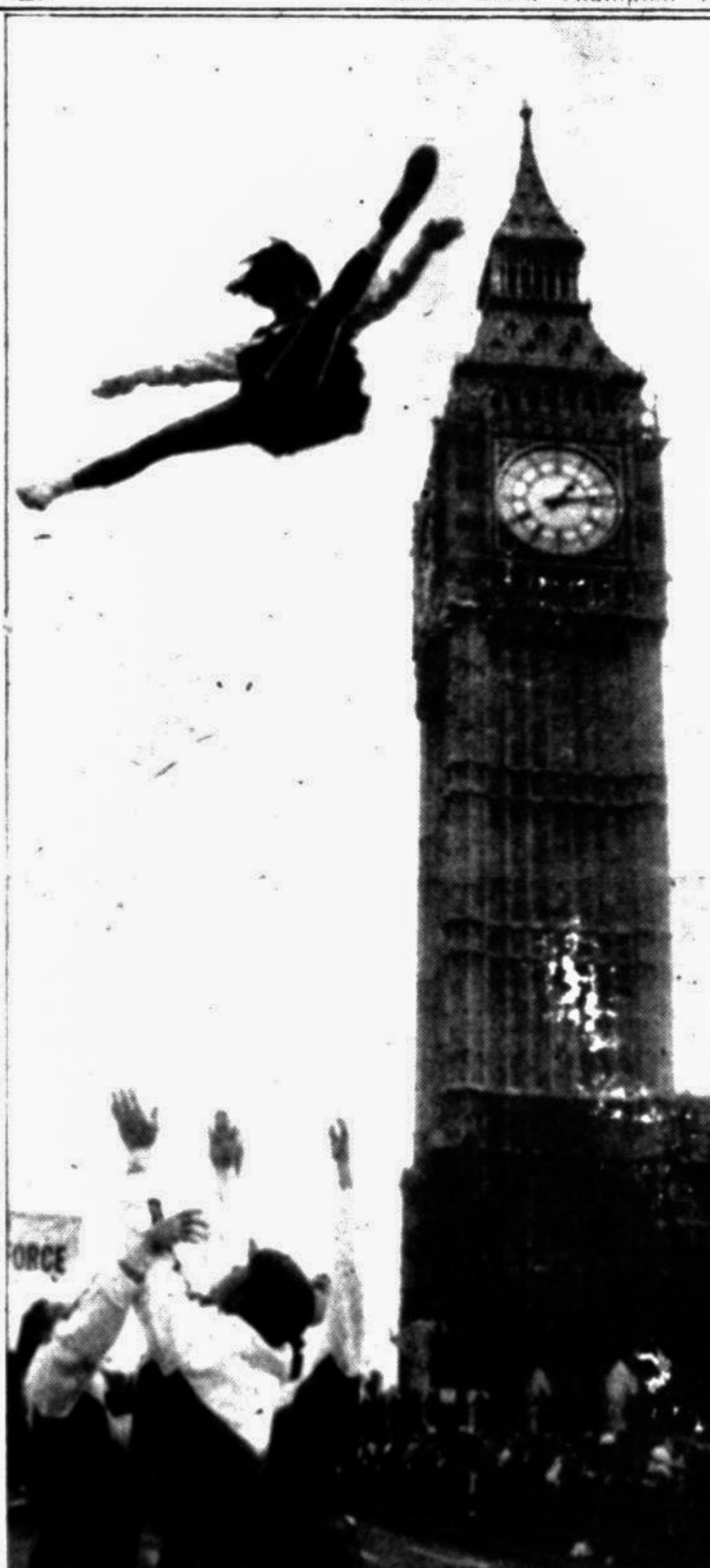
Jumping for joy in the shadow of Big Ben, some 1,500 cheerleaders from the Universal Cheerleaders Association (UCA) of America take part in London's New Year parade.