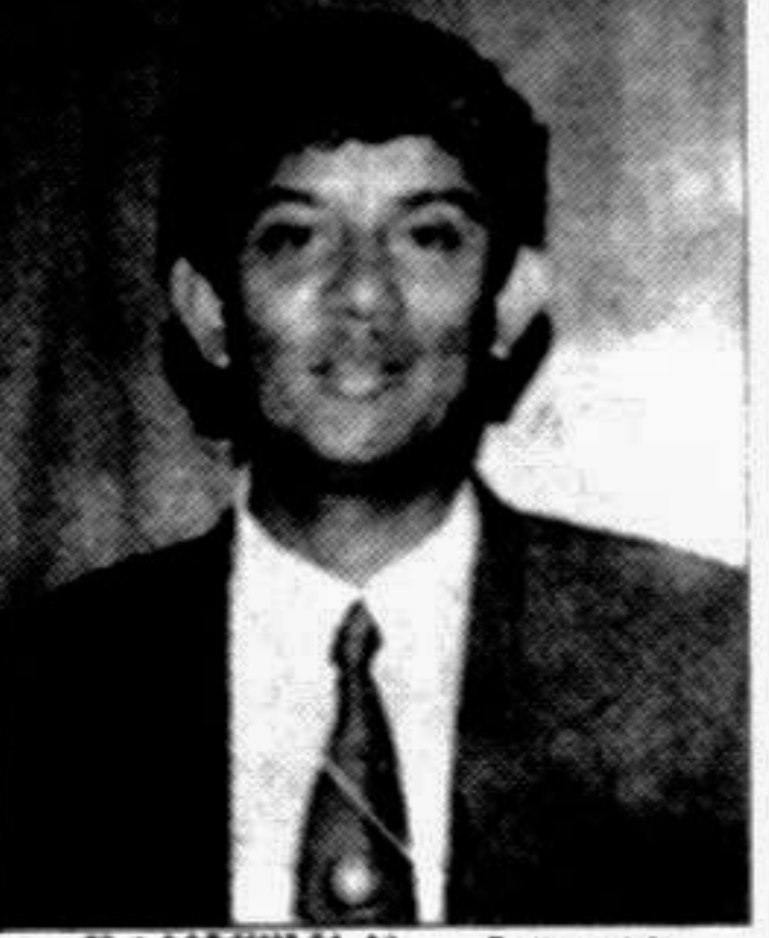
BAHUTULE ... 5 for 41