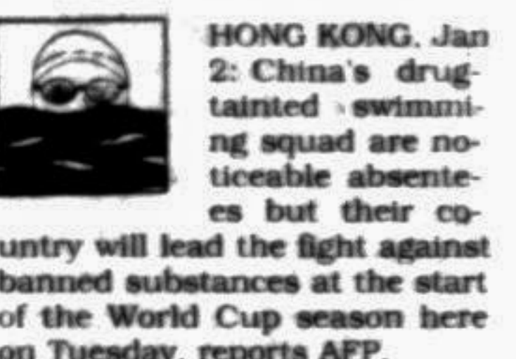
HONG KONG, Jan 2: China's drug-tainted swimming squad are noticeable absentees but their country will lead the fight against banned substances at the start of the World Cup season here on Tuesday, reports AFP.

China, which was severely embarrassed by the Asian Games drug scandal after winning 12 of the 16 women's titles at last year's World Championships, gave visa problems and the need for rest to explain its World Cup absence.