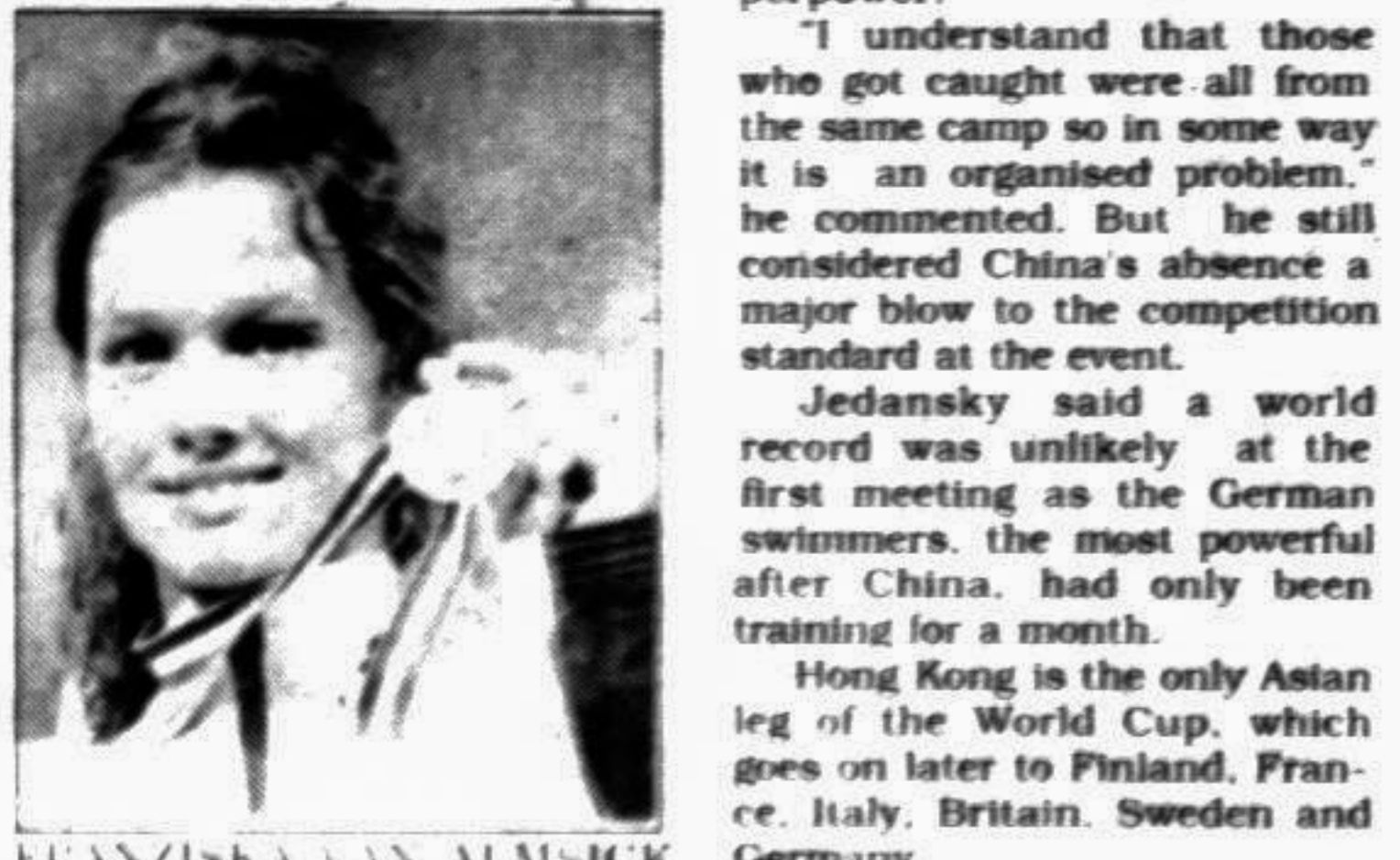
FRANZISKA VAN ALMSICK