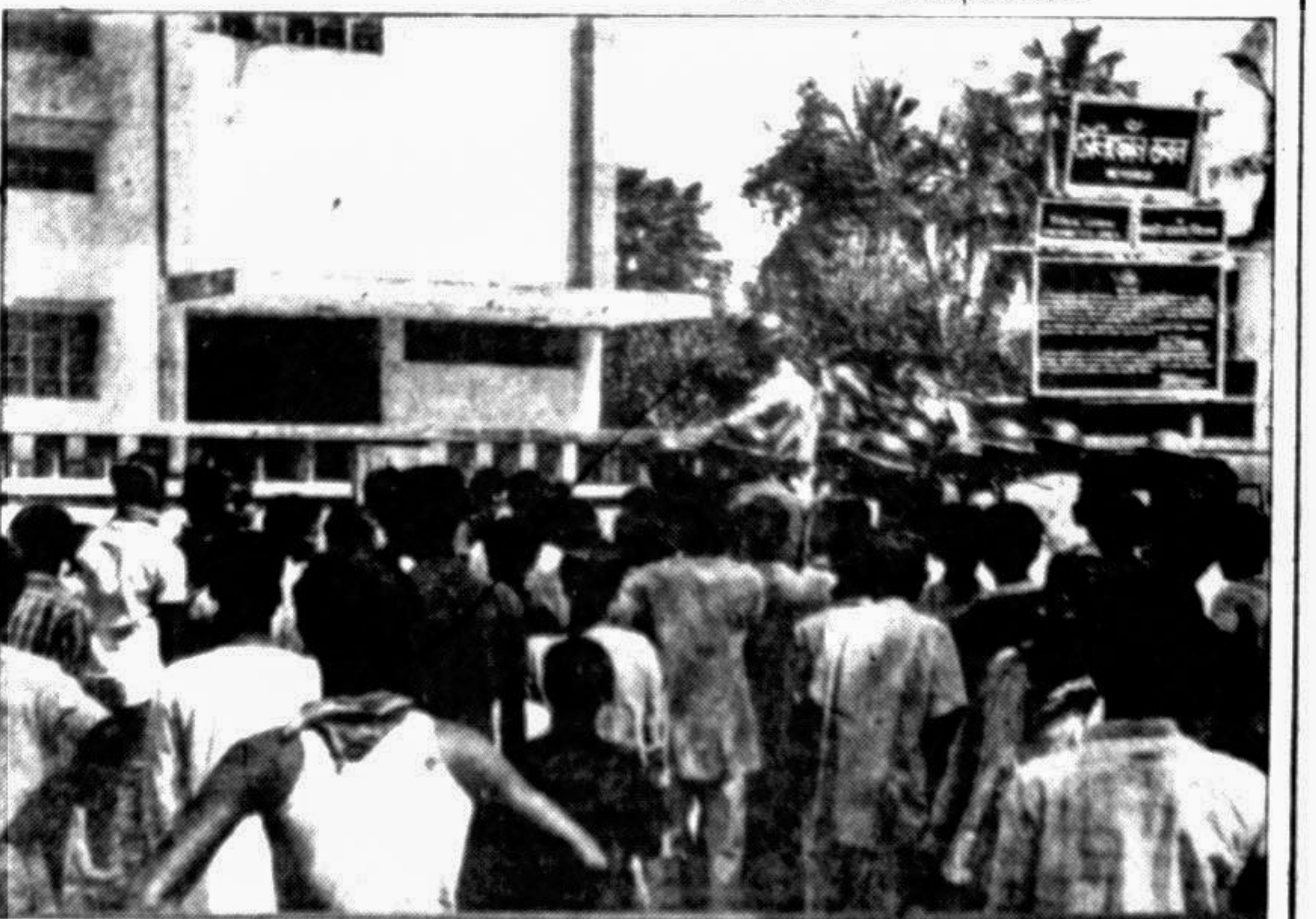
The people of Jessore surrounded the enemy soldiers in front of the telephone office building on March 3, 1971.

Shafi's house is a small museum now. It is full of pictures