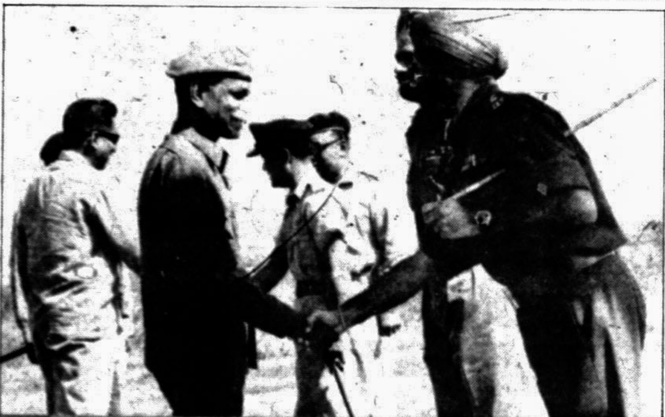
The Supreme Commander of the allied forces, Lt Gen Jagjit Singh Aurora welcoming Commander of Sector No. 8, General Osmani at Muktinagar, Jessore. The picture was taken sometimes in first week of December, 1971

When asked, whether he has any plan to make best use of his pictures, carefully preserved so far, he told Daily Star that he has plans to publish an album for handing over to next generation enabling them to know real history of Liberation War fairly, impartially and passionately. But due to fund constraint, he could not take up the work yet.