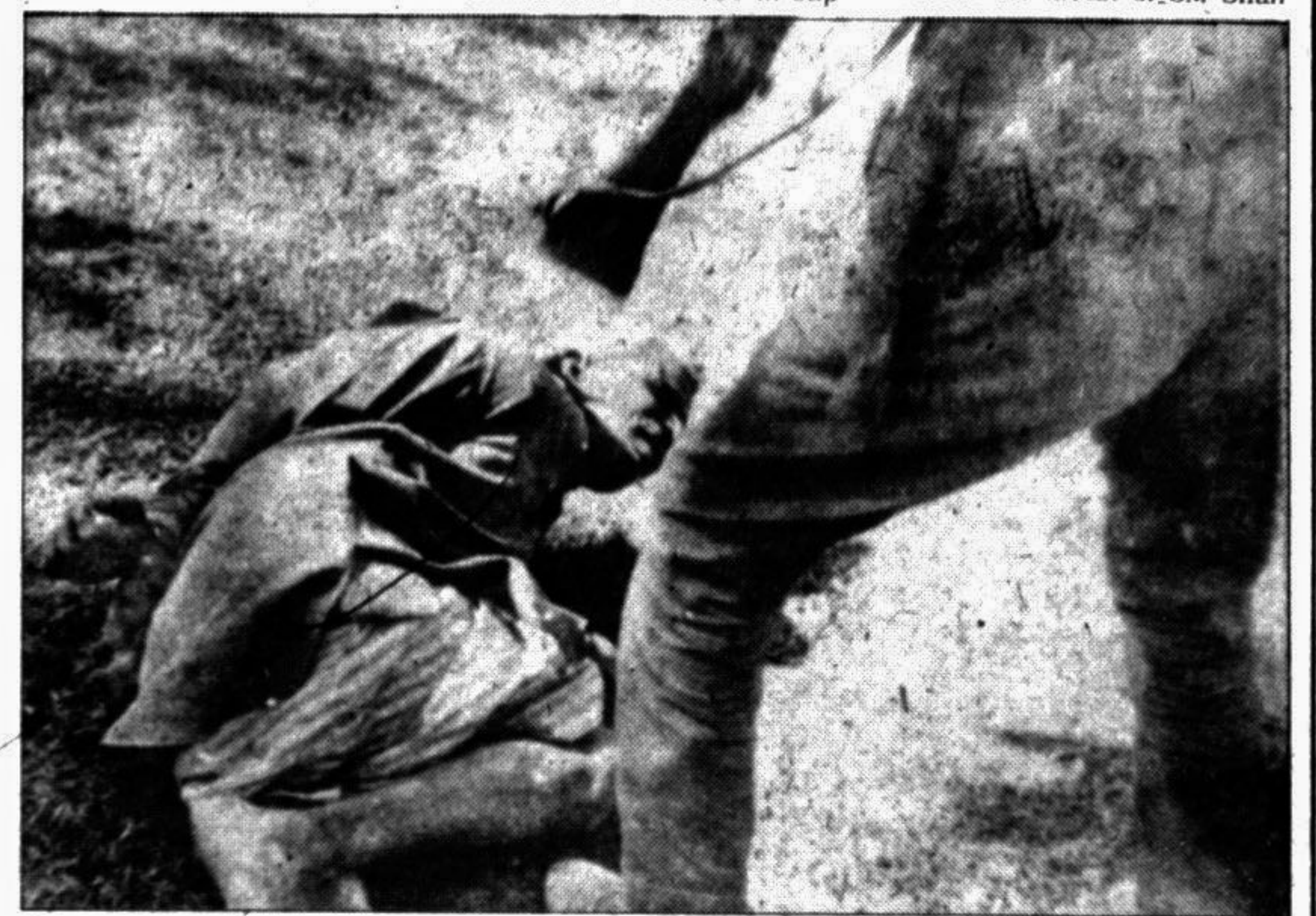
A man with his hands tied behind is being tortured by a Pakistani soldier in Jessore on April 4, 1971