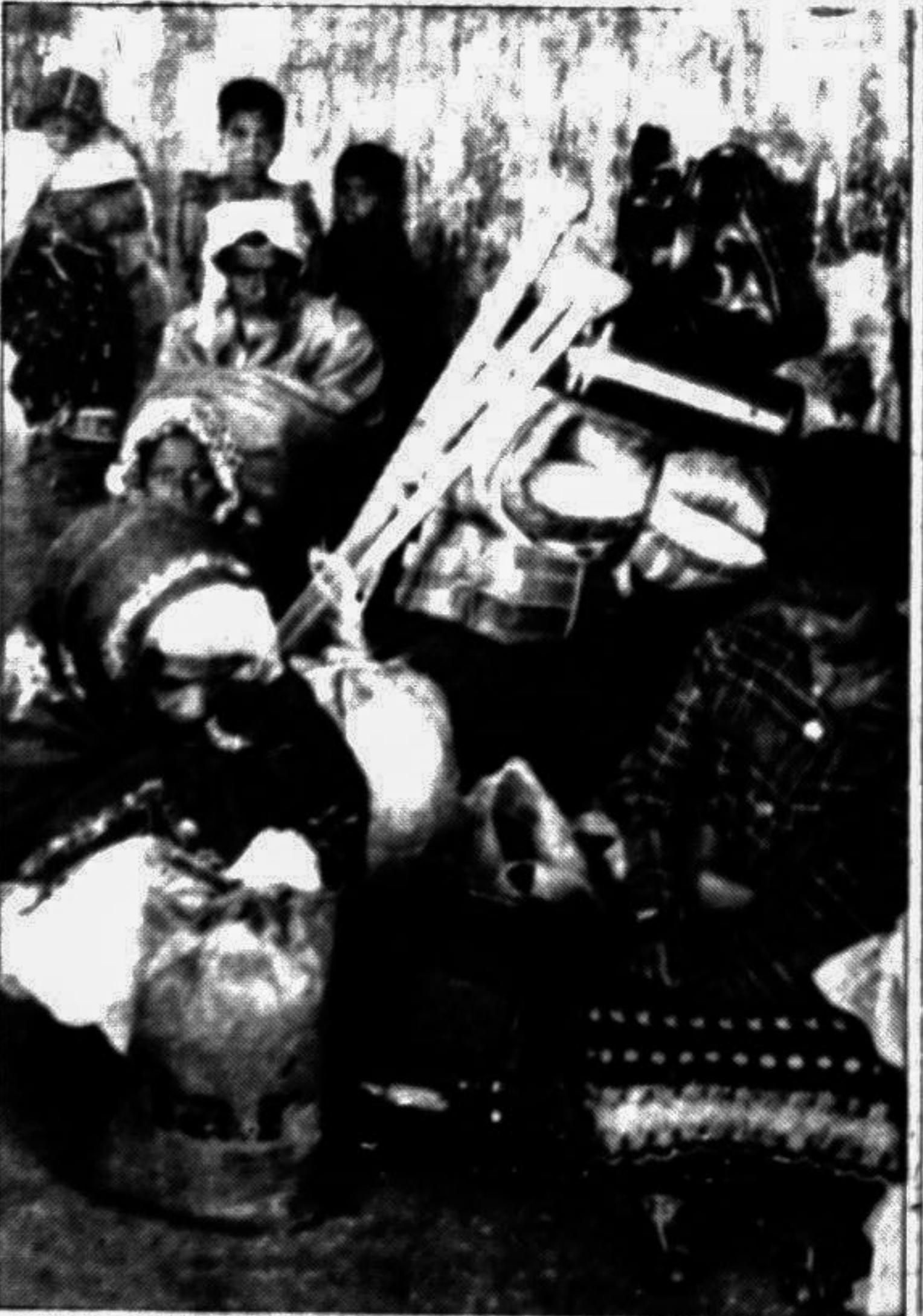
LEFT IN THE COLD: A stranded family having a long wait to board a launch at the Sadarghat Launch Terminal during the opposition-called 8-hour hartal in the city yesterday.

CHITTAGONG, Jan 2: A special squad of the port police recovered 560 pieces of contraband current net and 2840 pieces of Chinese padlock worth about taka five lakh from a boat at the river Karnaphuli here last night, reports BSS.