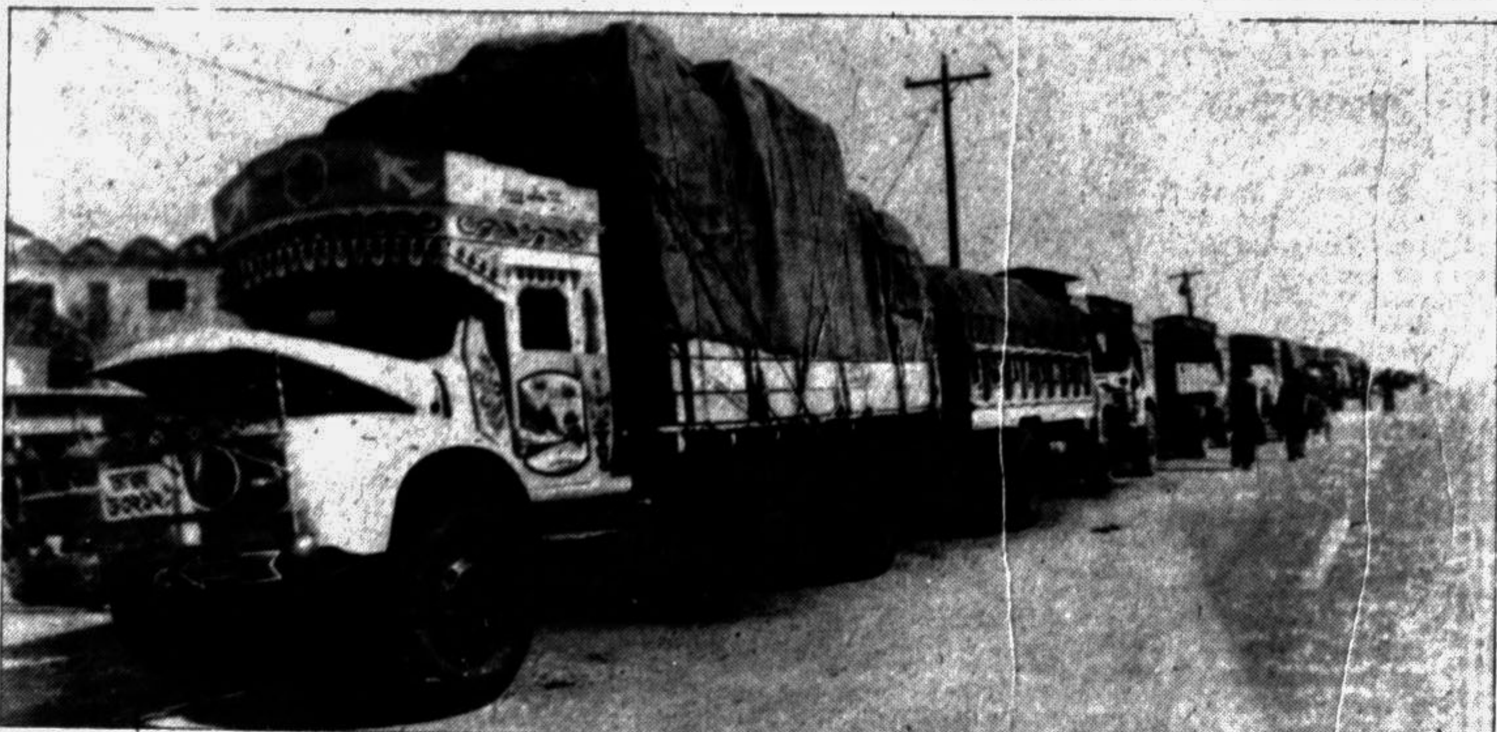
BIONIC BEELINE: A long queue of loaded trucks at a standstill near city's Aminbazar roadside yesterday following the countrywide 24-hour transport strike called by the Bangladesh Transport Workers' Federation.