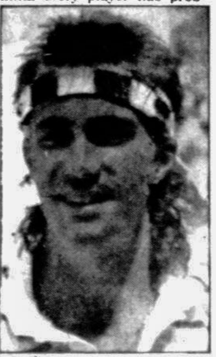
PAT CASH lems with their serve, but as far as power goes, I think it's now as powerful, if not more powerful.

"I've done a lot of studying and video analysis of my serve, and the serves of other players, to help me visualize the right way to serve." "It might not look that obvious to most people, but it's a quite significant change." Cash, who led Australia to two Davis Cup titles, said he still is a long way from his best. "I've been working like a slave to get back and things are going well so far," he said. "The object is to start playing these (top) guys, so it's obviously very exciting for me to start playing them again—at least being in the tournaments with them." "Maybe you lose the first round a few times, but it doesn't matter as long as you are in there." "The goal is to keep improving and stay injury-free, and if you do that you'll play good tennis." Cash's current comeback is his third since his Wimbledon triumph—and he says he is more determined than ever. "With my back they wrote me off and I came back, and after my Achilles injury they wrote me off and I came back." "I think people are going to run out of ink before I disappear."