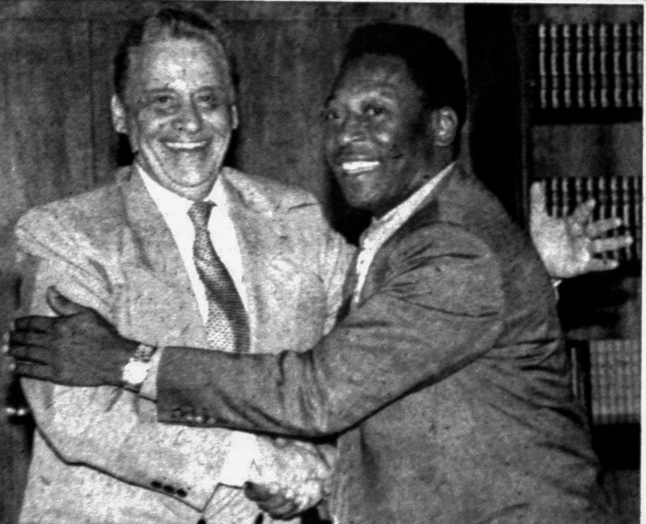
Brazilian President-elect Fernando Henrique Cardoso (R) embraces Edson Arantes do Nascimento "Pele," during a meeting in Brasilia on Dec 29. Pele has been nominated to Special Minister of Sports in Cardoso's cabinet.

CRYPTOQUIP B P W A W J V C G T R A R G J V J L V W G B V V X V F J C A F A G T A Z N V W W L V W G X J V C T G J A T Z F N C C V T J X P Yesterday's Cryptoquip: TOP GOLF PLAYER'S HANDICAP WAS HIS WIFE AND EIGHT CHILDREN. Today's Cryptoquip clue: F equals C The Cryptoquip is a substitution cipher in which one letter stands for another. If you think that X equals O, it will equal O throughout the puzzle. Single letters, short words and words using an apostrophe give you clues to locating vowels. Solution is by trial and error.