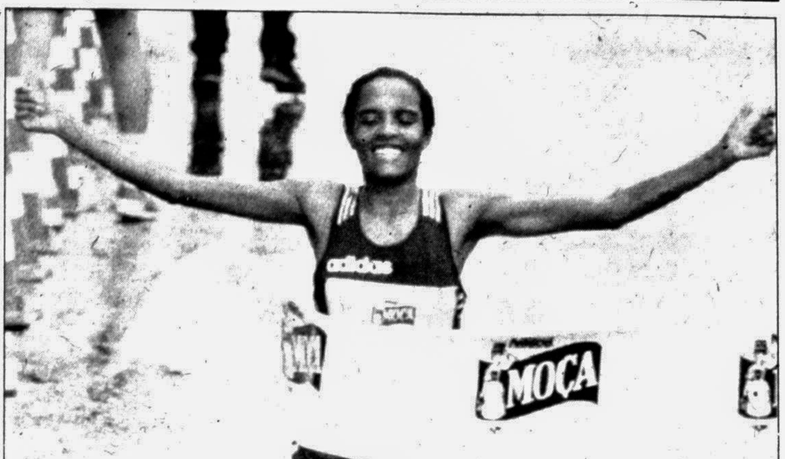
Derartu Tulu from Ethiopia crosses the finishline in the 70th San Silvestre New Year's eve road race through the streets of Sao Paulo, Brazil on Dec 31. It is the first time Ethiopia wins this race in women's category.