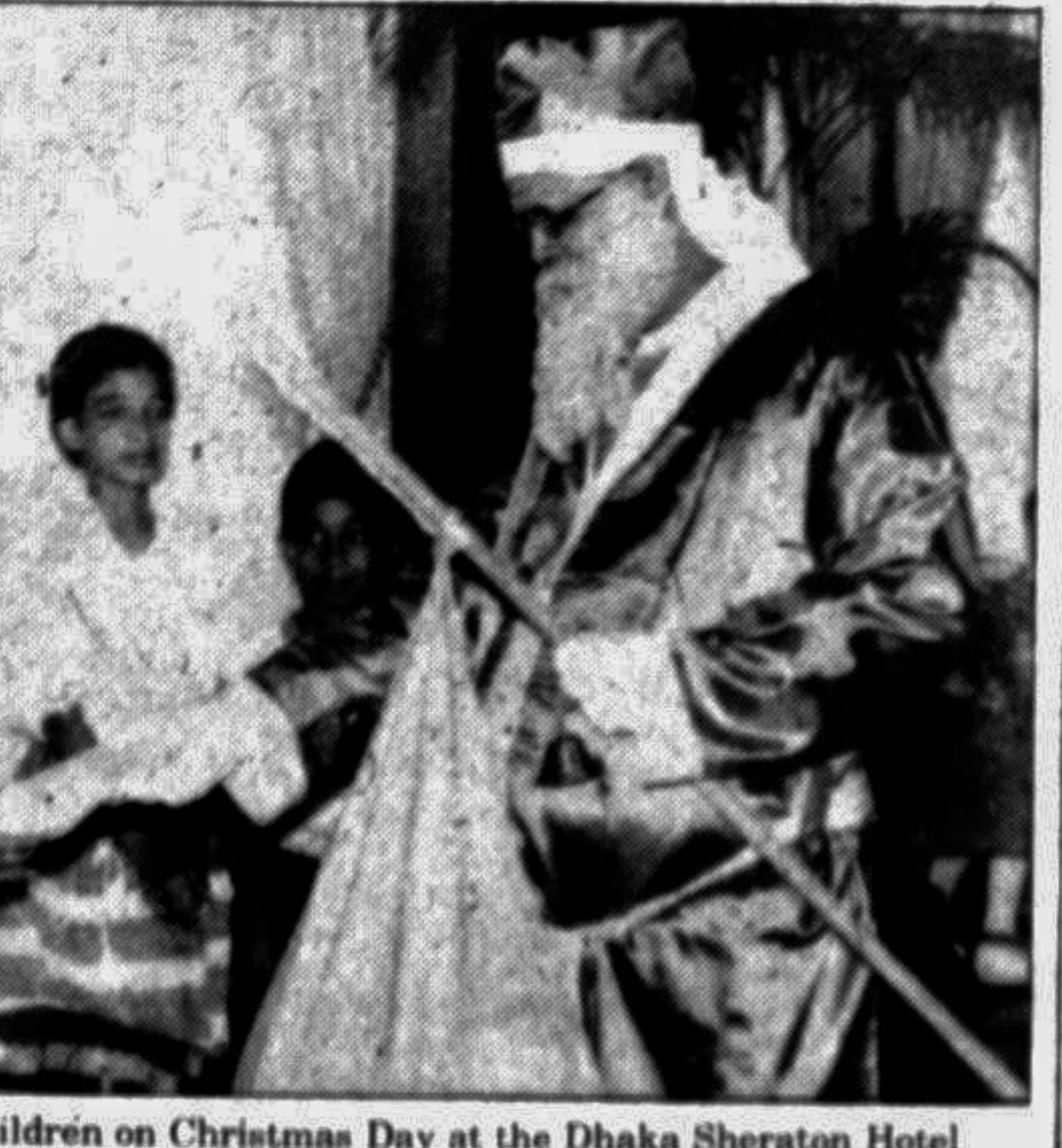
Santa Claus presented gifts to children on Christmas Day at the Dhaka Sheraton Hotel.