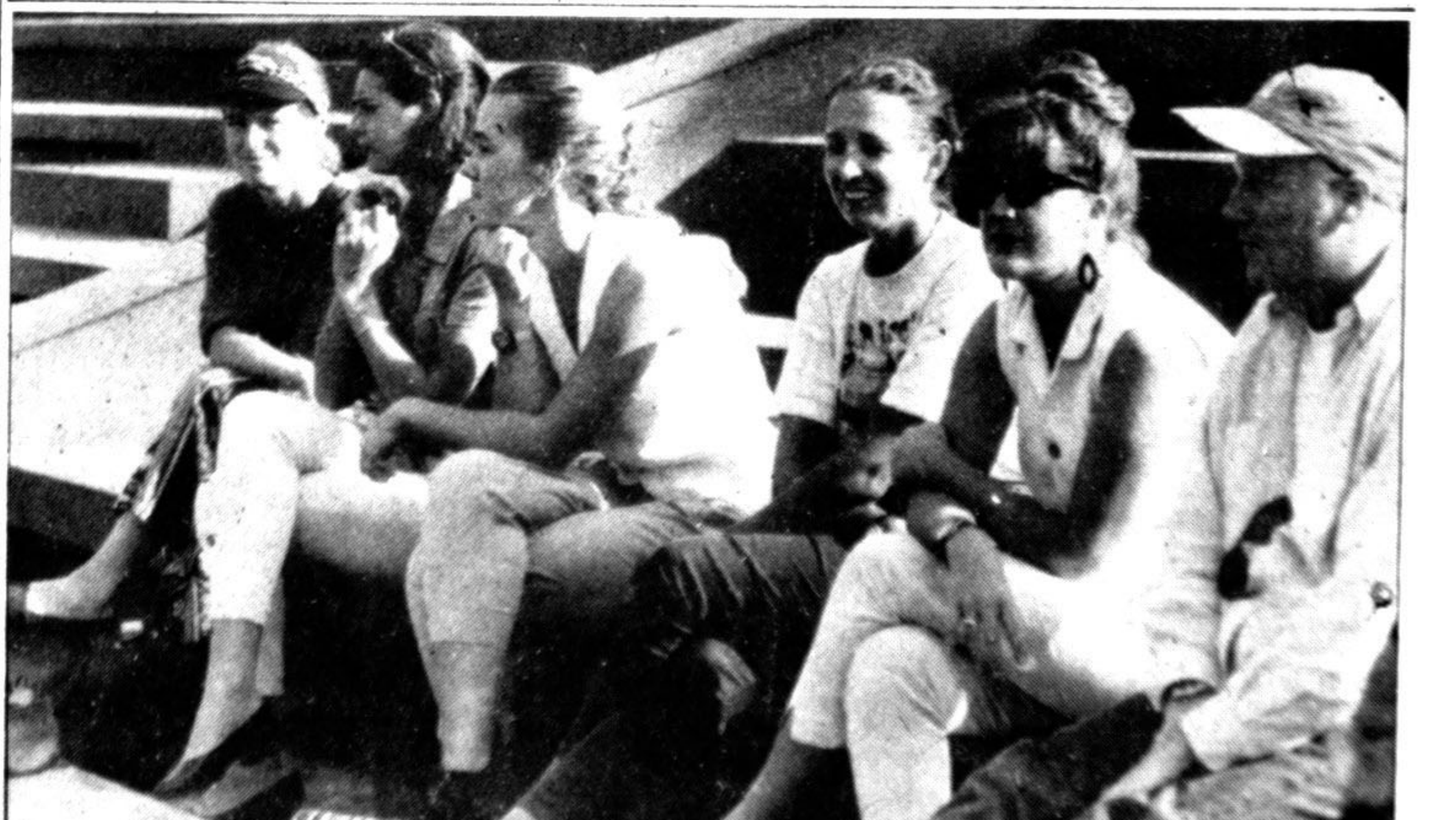
Things that keep you going in life's gruelling sets. When the proceedings at tennis courts turn drab lensmen's search for variety tend to obscure the game itself. After all the purpose of all games is to enliven the spirit. If it is not there in the middle, look elsewhere.

The second half, one of the most remarkable goals-