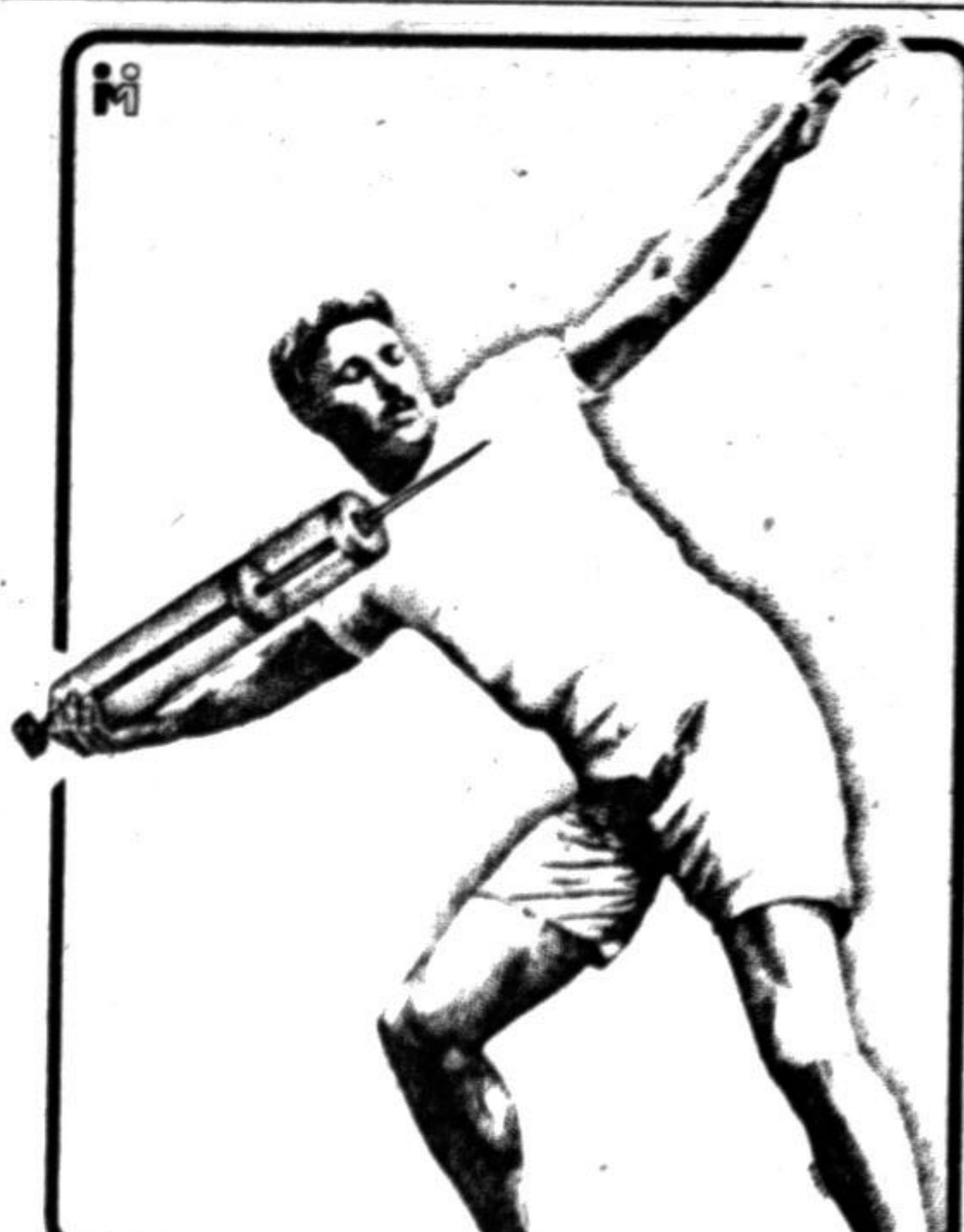
Even in notoriously amateur sports such as athletics or rugby union the superstars are millionaires in Europe and North America, the tax authorities are taking a close look at some of the earnings of amateur sportsmen and women and more financial scandals will surface.

Soccer, though, is still the world's most avidly watched game. Week in, week out fans will continue to follow the