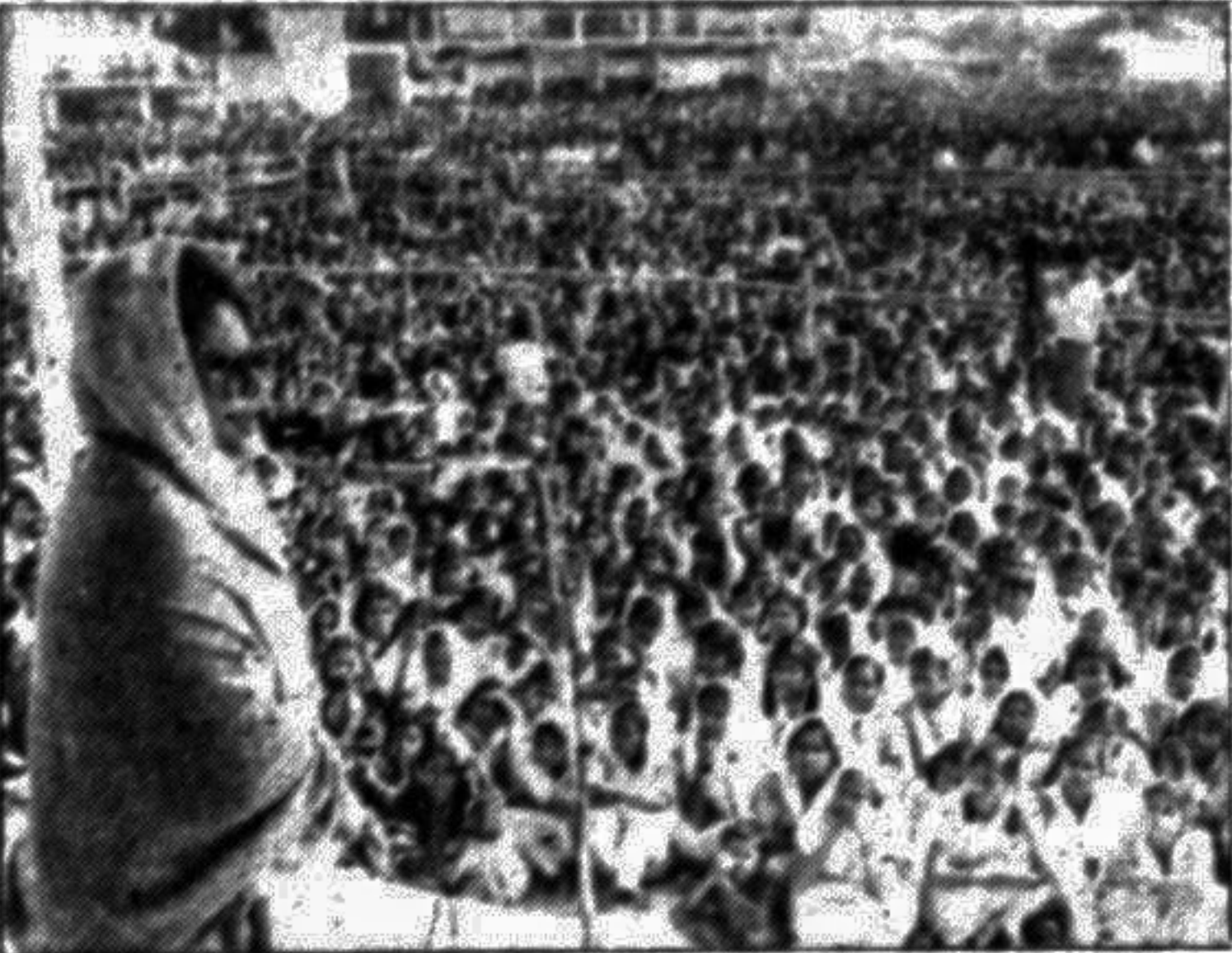
Prime Minister Begum Khaleda Zia addressing a public meeting at Baliakandi in Rajbari district yesterday.

Some changes have been made in the time schedule of various examinations due to unavoidable circumstances over the next few days, according to press release yesterday reports BSS. The revised timing of professional examinations under the medical faculty of Dhaka University is: Pharmacology between 2:30 pm and 5:30 pm on January 2, Anatomy second paper and Medicine second paper between 2:30 pm and 5:30 pm on January 3, and Forensic Medicine between 2:30 pm and 5:30 pm on January 4. The Degree (Pass and subsidiary) examinations of the National University scheduled for January 2, 3 and 4 will be held at 2 pm instead of 10 am on those days. The time schedules of examinations for other days will remain unchanged. The viva-voce of the 15th BCS, 1993-94 under the Bangladesh Public Service Commission will now be held at 2:30 pm instead of 9 am on January 2, 3, and 4. The viva-voce of the 16th BCS (special) 1994 will be held at 2:30 pm on January 5 and 9 instead of January 2 and 4. The half-yearly departmental examinations of 1994 scheduled for January 2, 3 and 4 will now be held on January 7, 9 and 10. The dates and time of other examinations will remain unchanged. Examinations of FCPS second part and MCPS will be held at 3 pm on January 2 instead of 9 am. Besides, examination of FCPS first part scheduled for 9 am on January 3 and 4 will now be held at 3 pm on those days. Examinations scheduled for other days (January 1 and 5) will be held as per the earlier schedule.