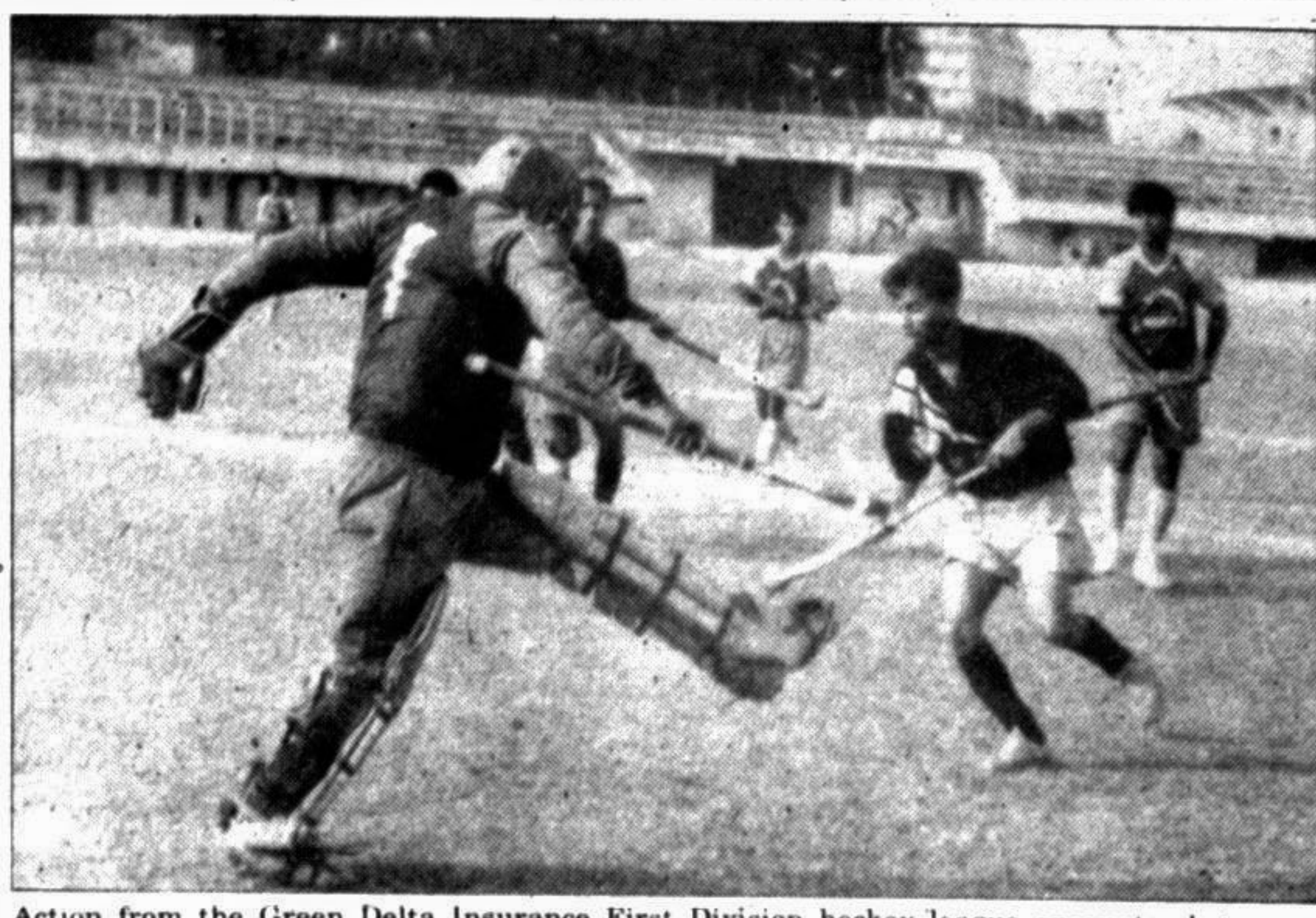
Action from the Green Delta Insurance First Division hockey league encounter between Bangladesh Railway and Bachelors Sporting Club at the Hockey Stadium yesterday. Bachelors won 3-1.