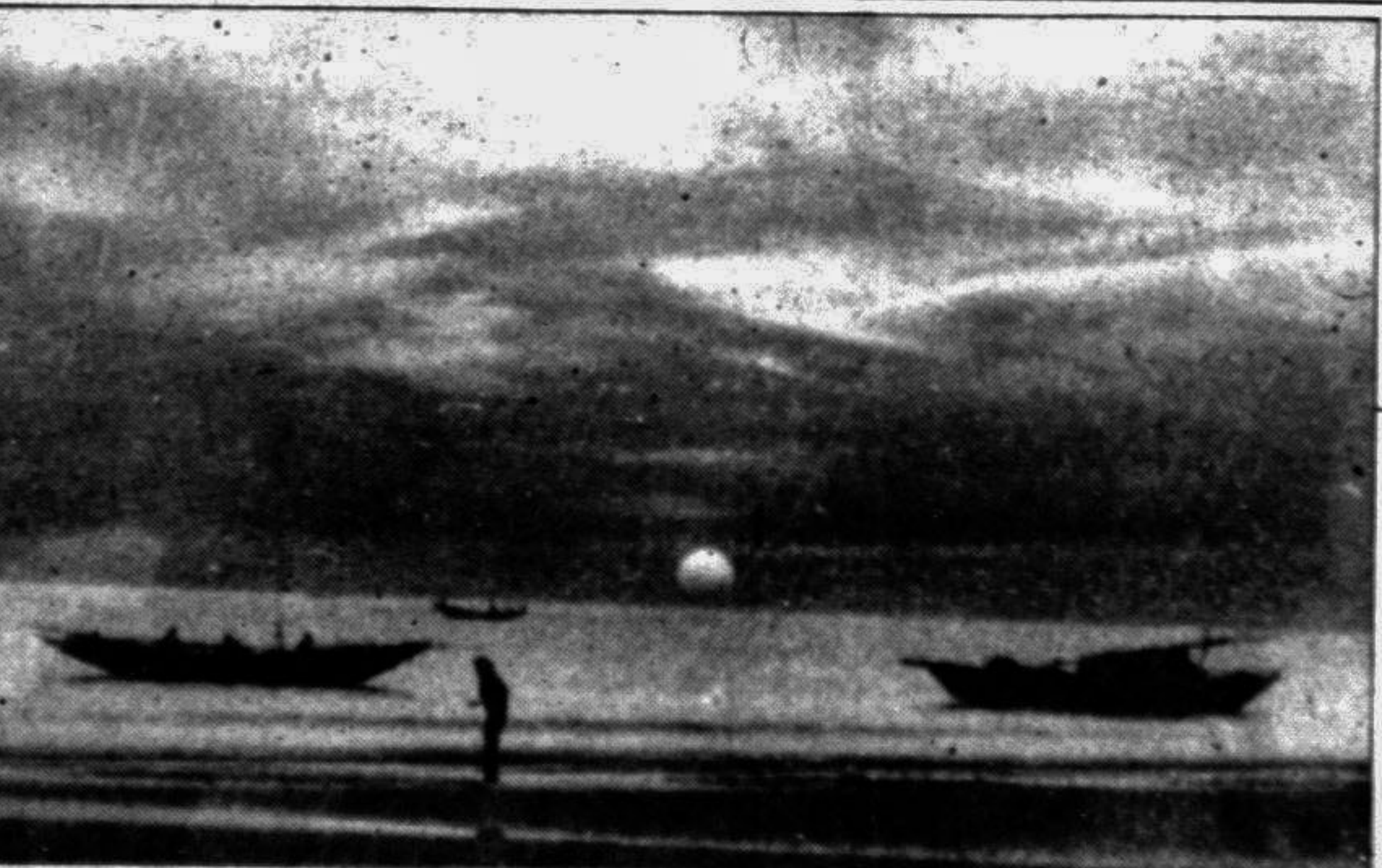
The setting sun bidding farewell to 1994 yesterday.