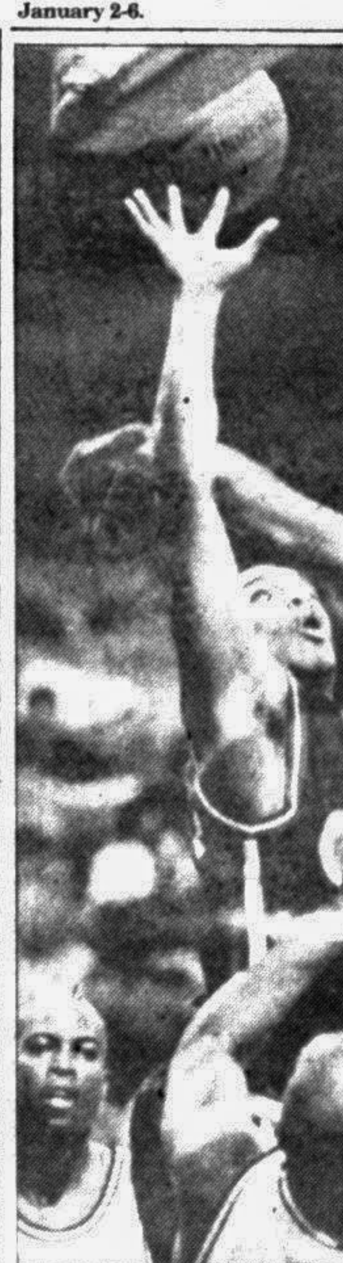
L.A. Clipper Terry Dehere tries to shot around Miami Heat centre John Salley during the second period action of their NBA game in Miami on Dec 29. The Heat defeated the Chippers 126-83.

Man-of-the-match: Fanie de Villiers (South Africa) Result: South Africa won by eight wickets First Test: Johannesburg - New Zealand won by 137 runs. Third Test: Cape Town - January 2-4.