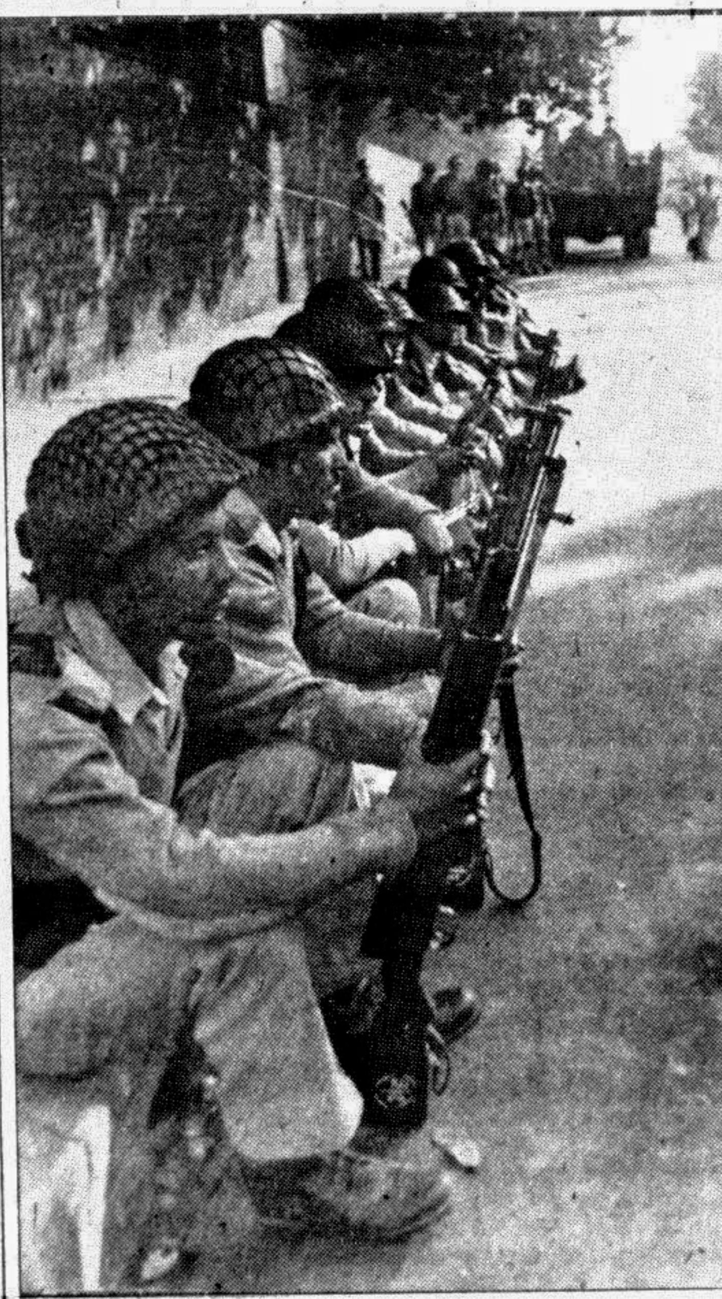
Bangladesh Rifles personnel manning the area around the Secretariat during yesterday's hartal hours.