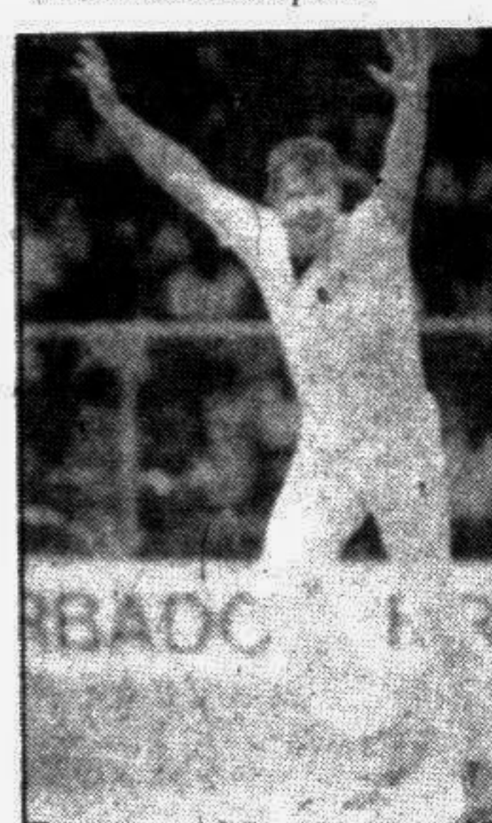
McDERMOTT ... m-o-m

After struggling early on the opening day, Australia made 279 in their first innings and gradually took command of the match from that point.