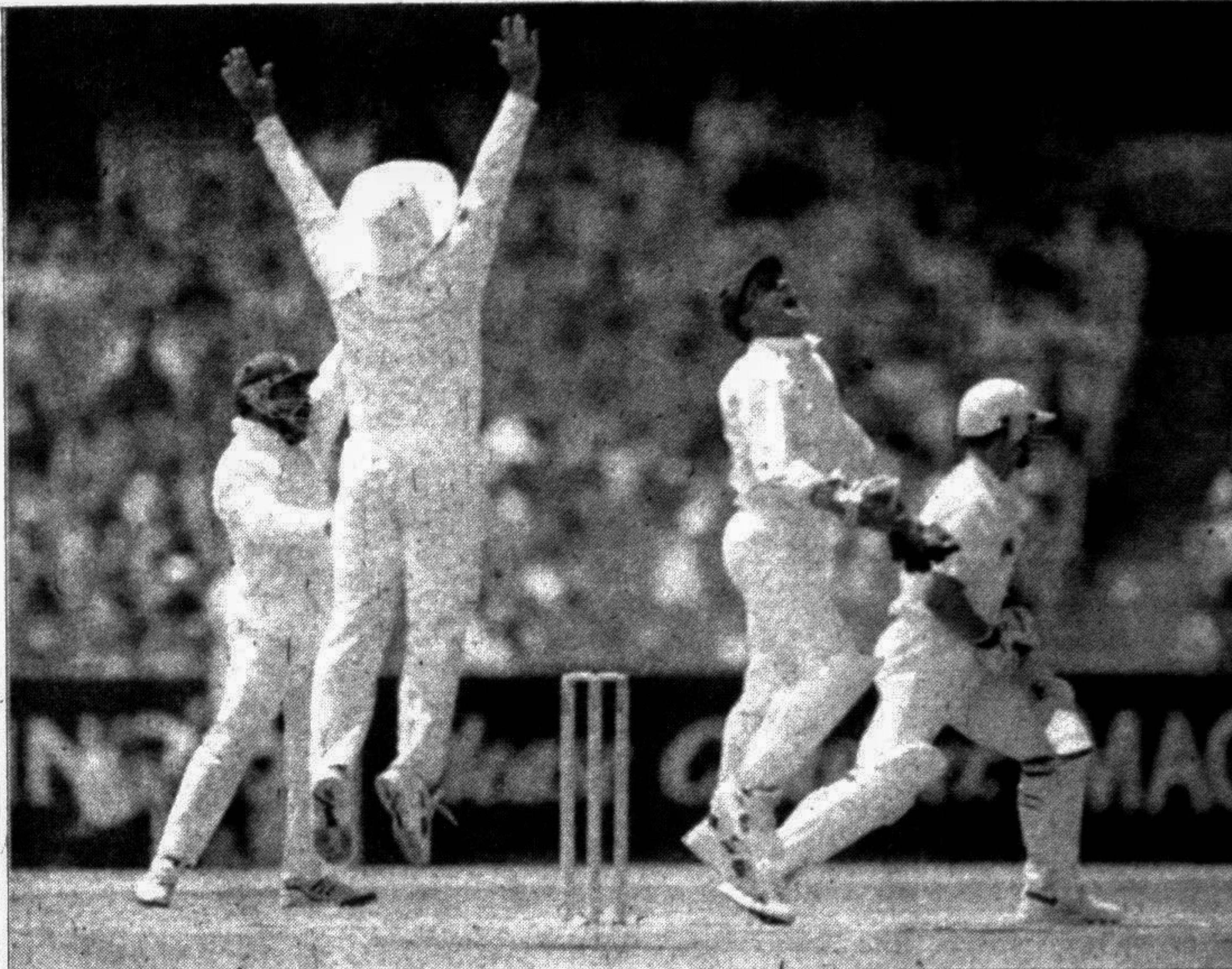
Australian fielders burst into ecstatic expressions after wicketkeeper Healy took a smart catch to dismiss England tail-ender Darren Gough off Warne who went on to snare last man Malcolm next ball. It meant the master leg spinner's maiden hatrick and a loss for England in consecutive Tests, this time at the MCG. The Aussies are now two up in the five-Test current Ashes series.

"If I beat Laker, I'd 'you beauty', but we're two-nil up in the series and the important thing is to win one more Test to make sure the Ashes are ours again," Warne said.