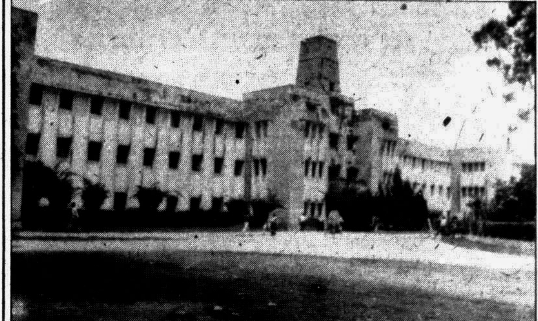
The main administration building of Rajshahi University.

examinations as departments introduce separate academic calendars. The teachers are taking care to publish results in good time. Recently Applied Physics Department has set an extraordinary example by publishing its 1st year result within 4 days of ending the ex-