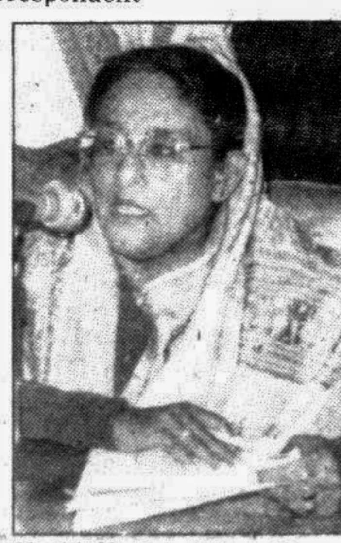
Sheikh Hasina at the Press Club yesterday. election schedule and holding of the polls under an advisory council to be formed by the President in consultation with the ruling party and opposition parties." See Page 12 Col 7