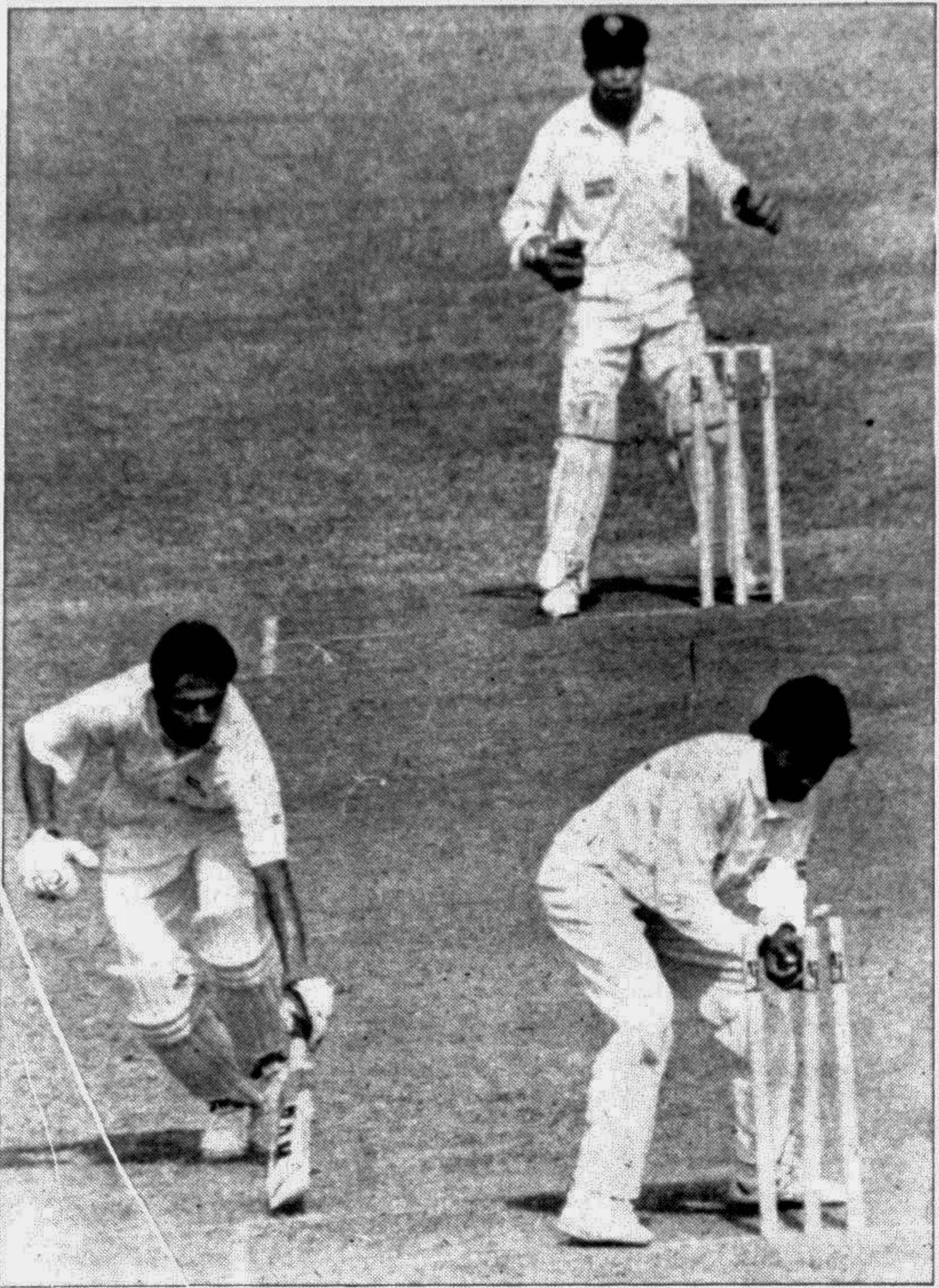
Indian batsman Sairaj Bahutule is still a couple of inches out of the crease as Bangladesh's Saiful Islam takes the bails off the wicket at the bowler's end. Young Bahutule left cheaply but India rattled 216 for six in the final of the SAARC cricket tournament to beat Bangladesh by 52 runs at the Dhaka Stadium yesterday.