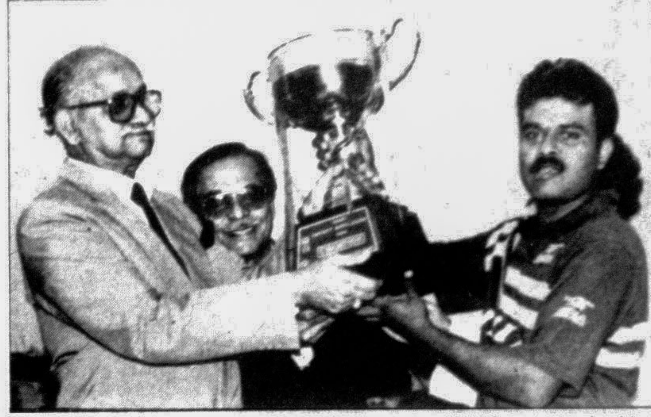
Indian captain Praveen Amre receives the four-nation SAARC invitational cricket tournament trophy from Foreign Minister A S M Mostafizur Rahman who is also the president of the Bangladesh Cricket Control Board (BCCB). India beat hosts Bangladesh by 52 runs in the final held at the Dhaka Stadium yesterday.