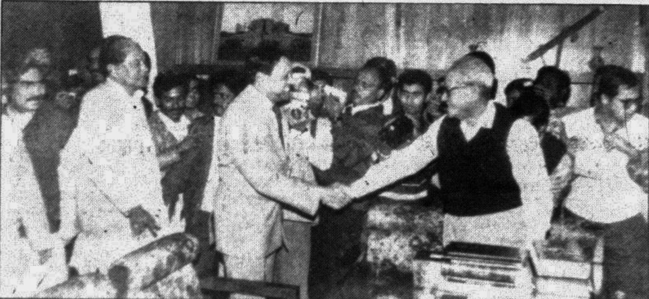
Jatiya Party leader Moudud Ahmed shaking hands with Deputy Speaker Humayun Khan Panni before submitting resignation letter.

BRAC will develop, produce and disseminate the knowledge and awareness on the above rights among the people. BRAC will also provide logistic support to the project. Details have been jointly prepared through consultation with UNICEF which will fund Tk 1.56 crore for the project. The one-year second phase of the project will commence on January 1, 1995.