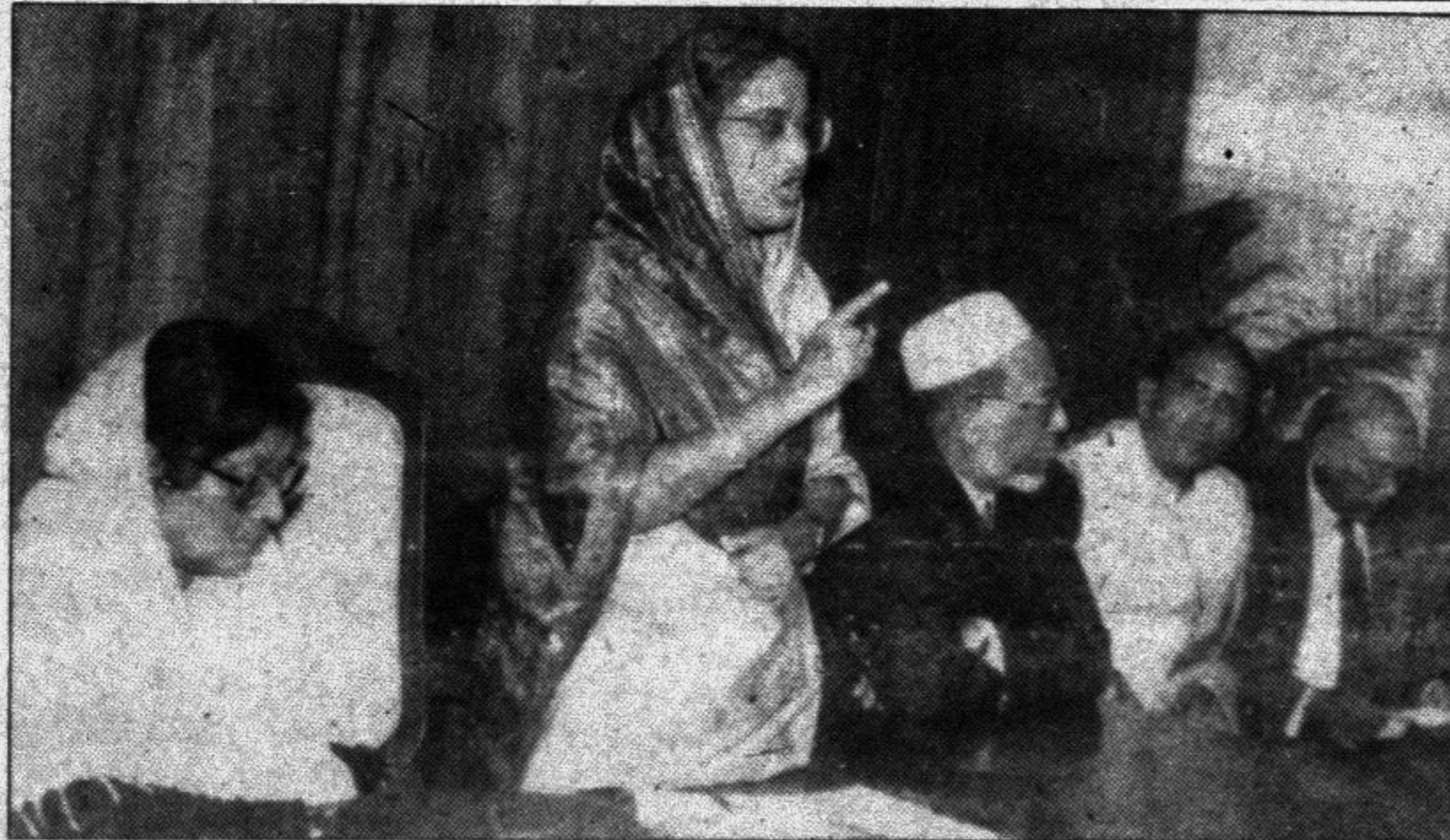
Awami League chief and Leader of the Opposition in Parliament Sheikh Hasina speaking at an extended meeting of the Awami League central executive committee in the city yesterday. Awami League leaders Sajeda Chowdhury, Abdus Samad Azad, Abdur Razzak and Tofael Ahmed are also seen.