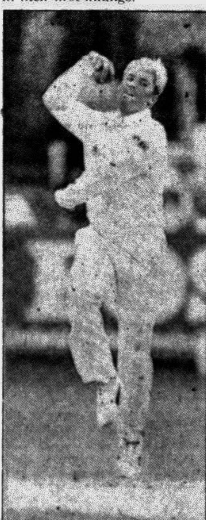
WARNE .... 3 for 34

Steve Waugh was earlier stranded six runs short of his eighth Test century as Australia were dismissed for 279 in their first innings.