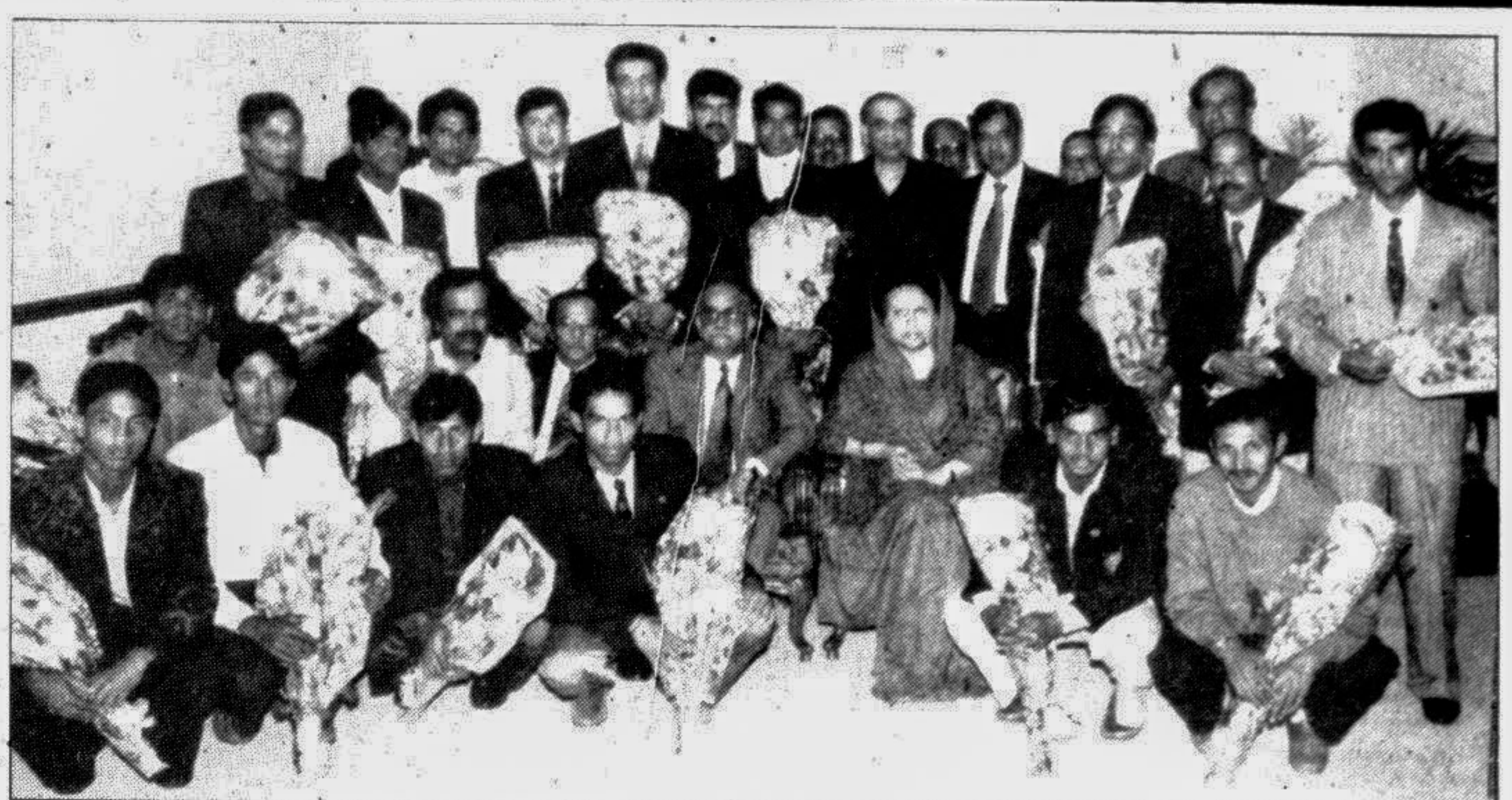
Prime Minister Begum Khaleda Zia congratulates the victorious Bangladesh team that beat India by one run in the SAARC cricket tournament at her Hare Road office yesterday. BCCB president Foreign Minister A S M Mostafizur Rahman is seen on her right.