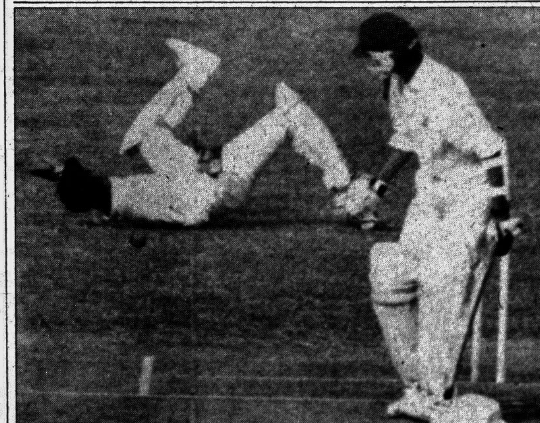
Bangladesh wicketkeeper who pulled off a vital stumping at the day's end to give the country's cricket lovers a memorable day is caught in the picture in one of his less cherishing moments at the Dhaka Stadium yesterday.

The Halifax Metro Center has been the site of many international sports events, but many more venues would have to be built to accommodate the Olympics, including a stadium to seat 50,000 people, a cycling oval, an Olympic-sized swimming pool and housing for athletes.