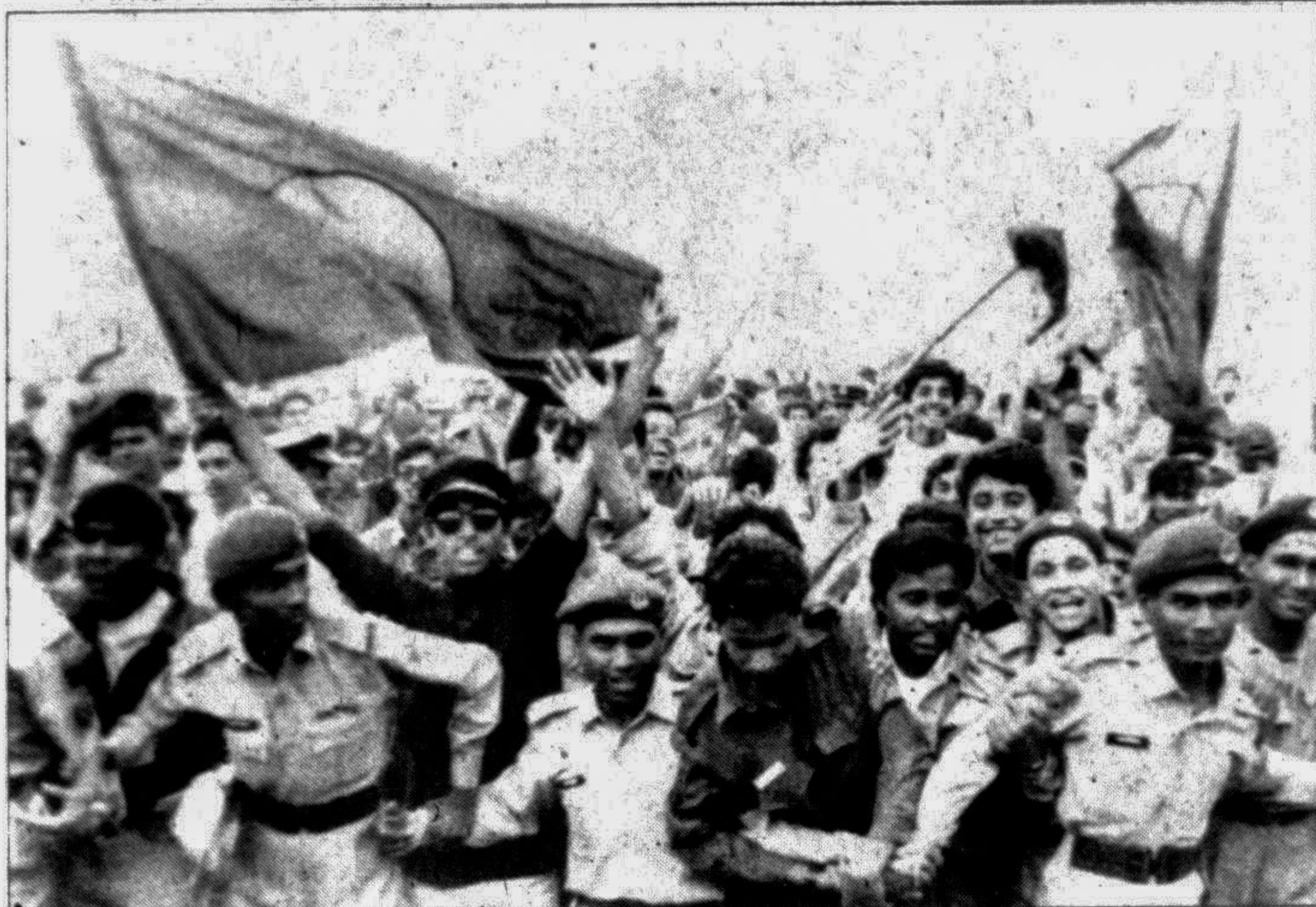
A TRULY VICTORY MARCH IN THE MONTH OF VICTORY... the men in uniform having a hard time to contain a jubilant crowd as they try to enforce some sort of an order prior to the award giving ceremony after Bangladesh's enthralling one-run win over India at the Dhaka Stadium yesterday.