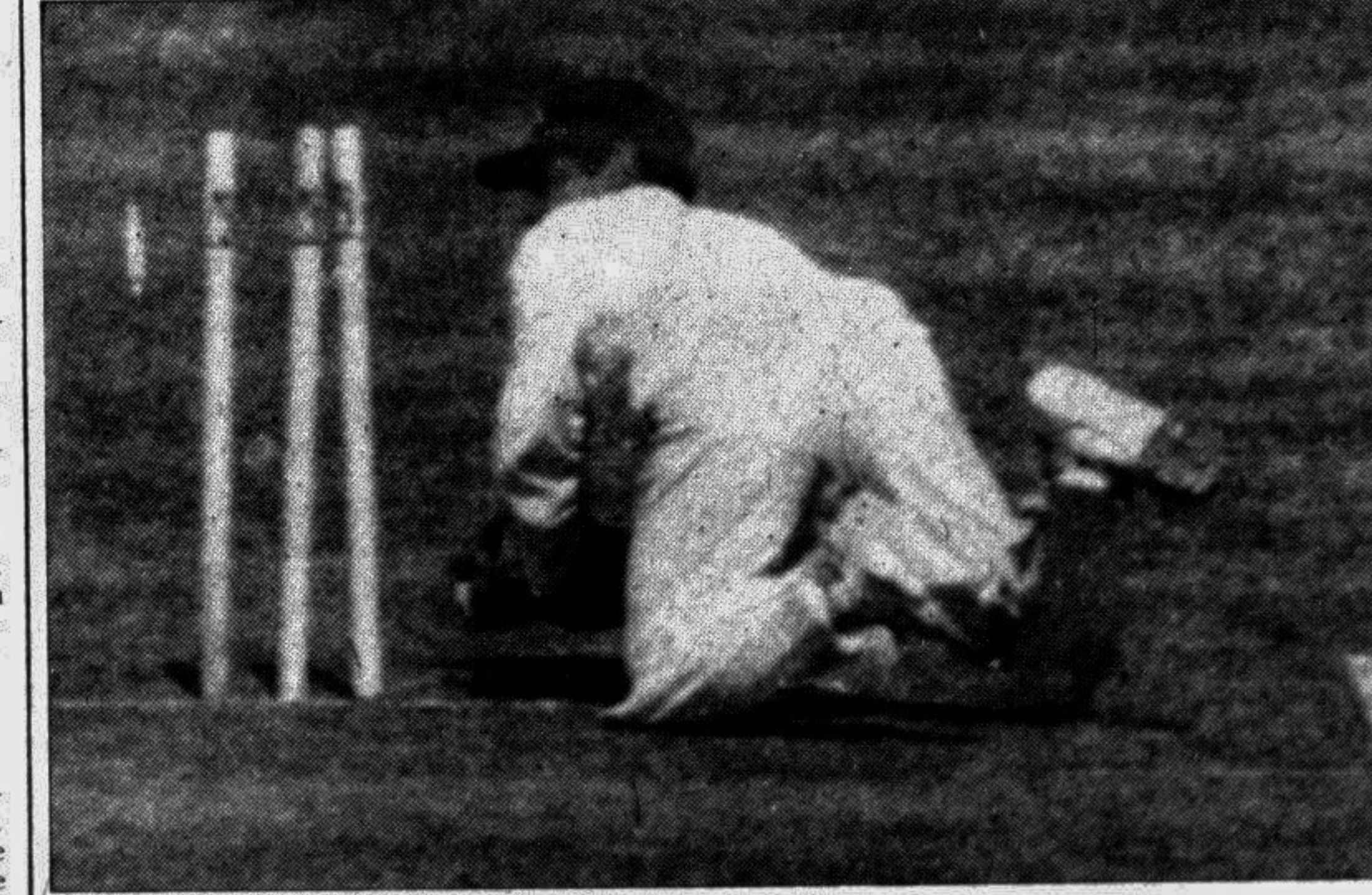
Indian wicketkeeper Vijay Yadav goes on his knees to run Pakistani Saqlain Mushtaq out during the crucial SAARC cricket tournament match at the Dhaka Stadium yesterday.

NEW ZEALAND: Bryan Young, Darrin Murray, Stephen Fleming, Martin Crowe, Ken Rutherford (captain), Shane Thomson, Adam Parore, Matthew Hart, Simon Doull, Chris Pringle or Richard de Groen, Danny Morrison.