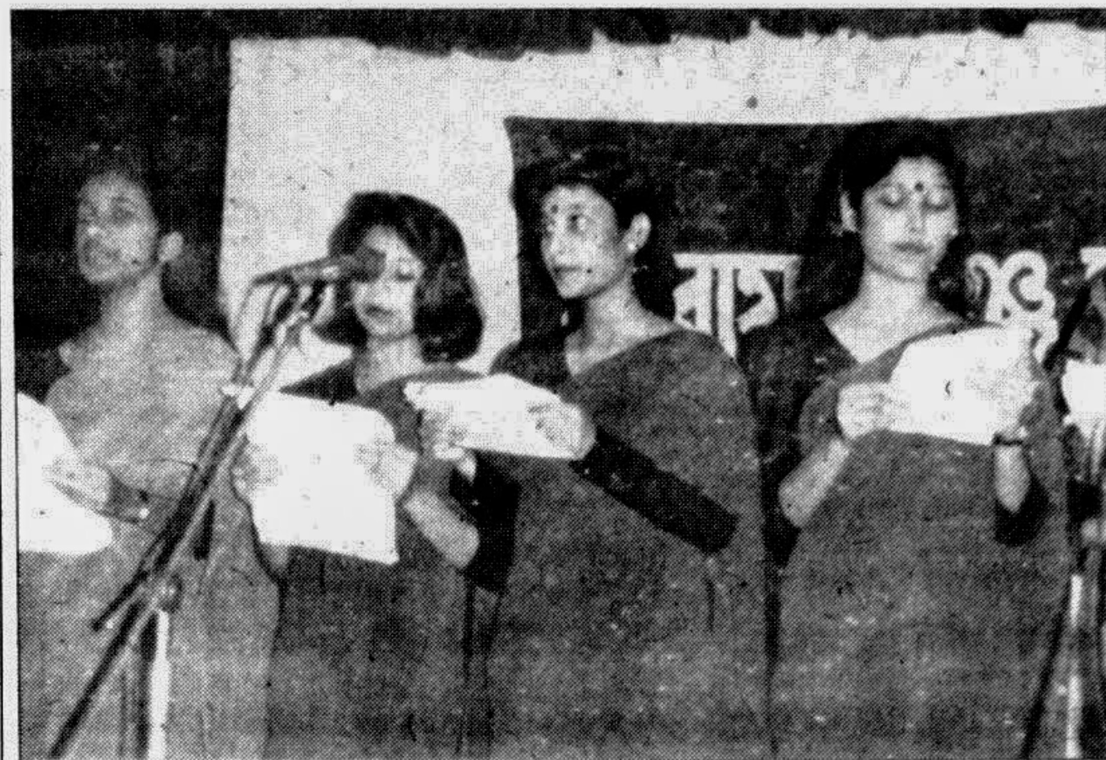
NARAYANGANJ: Members of Kathamala performing a recitation at a cultural programme at the local Central Shaheed Minar recently on the occasion of Victory Day.

Two members of the Parliament from the district, DC Natore, SP Natore, Chairman of Natore Pourashava and local political and social leaders were present at the meeting.