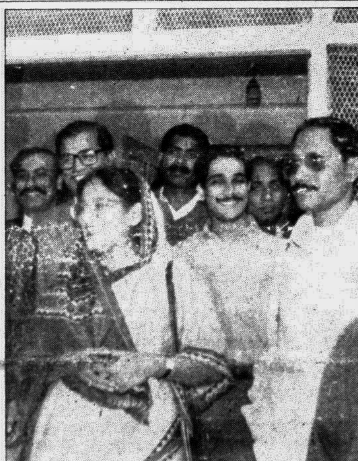
Awami League chief and Leader of the Opposition in Parliament Sheikh Hasina vacated her Minto Road residence yesterday.