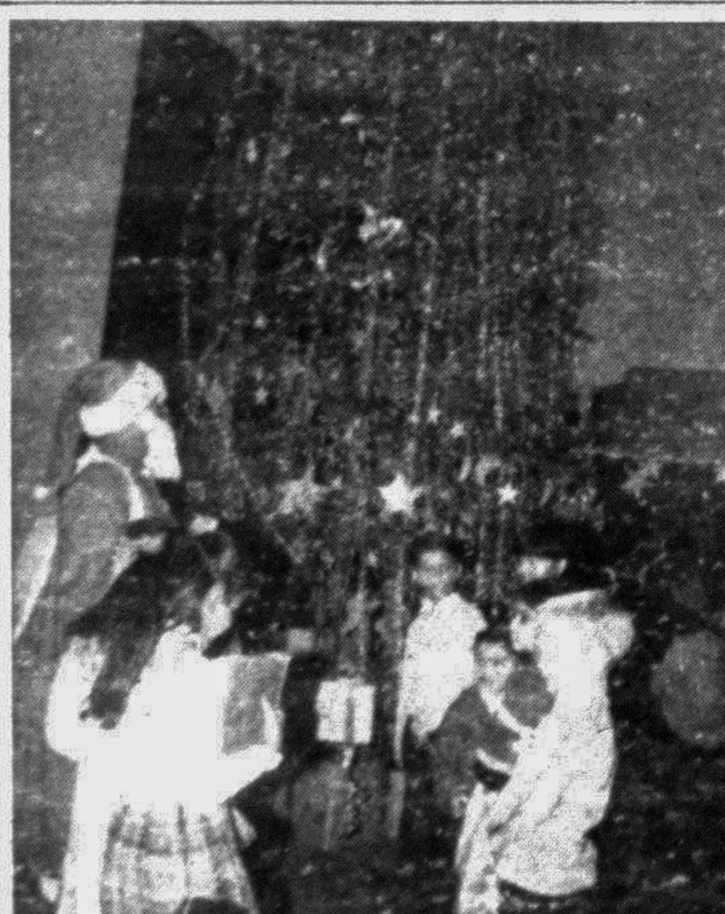
A group of children meet Santa Claus at a Christmas Day celebration in a city hotel yesterday.