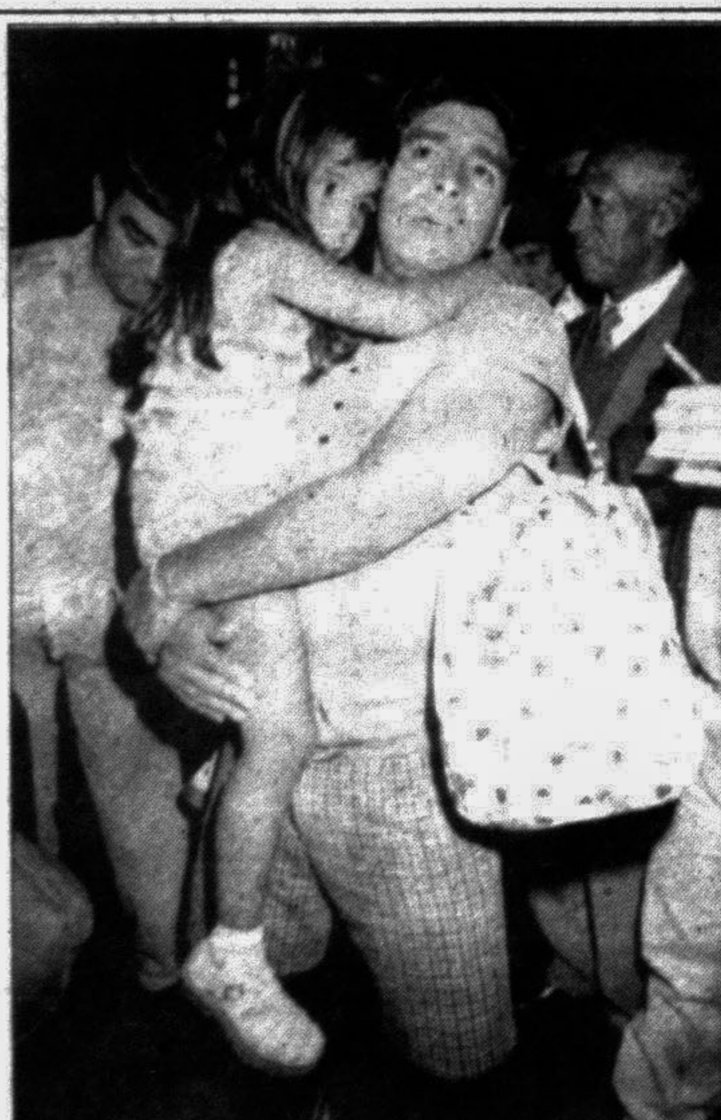
Argentinian soccer star Diego Maradona arrives at Jose Marti airport in Havana yesterday. He is in Cuba with his family for holidays at the invitation of a local hotel.