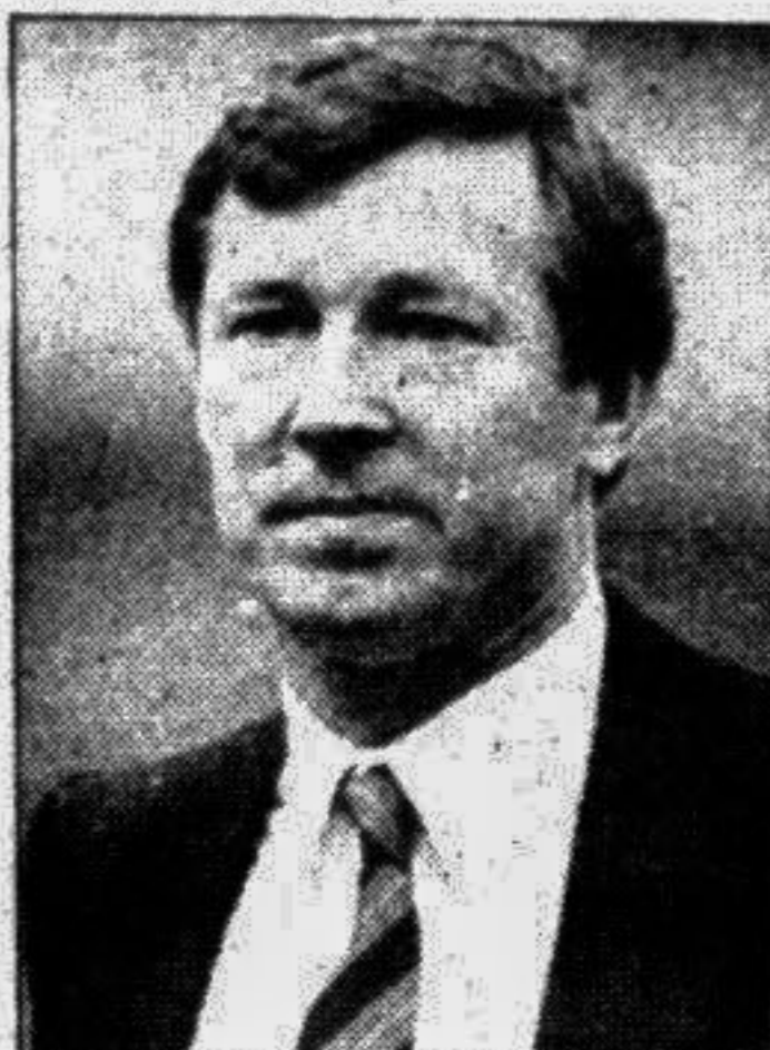
ALEX FERGUSON - Manager Howard Wilkinson is usually reluctant to change a winning side but McAllister is certain to regain his place in midfield after missing the 3-1 win at Arsenal.

England central defender Steve Howey, who missed the league cup defeat by Manchester City in midweek because of illness, and England midfielder Robert Lee are also back in contention. Brian Deane starts a two-match suspension but Leeds have skipper Gary McAllister back from international duty with Scotland.