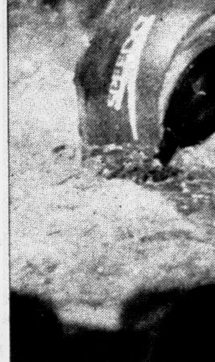
An AFP file photo of Chinese swimmer Lu Bin, who won the silver medal on the 100m freestyle event at the World Championships in Rome on Sept 6, tested positive for drugs.

The China connection has only helped underline how drugs have seemingly become a key player in international success. A host of top athletes from the west are strongly suspected of using drugs but despite the use of widespread testing the private chemists