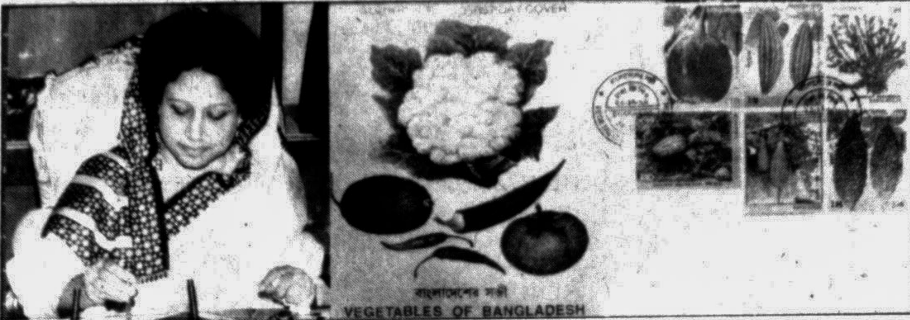
Prime Minister Begum Khaleida Zia formally releasing a set of commemorative postage stamps and a first day cover on the vegetables of Bangladesh in the city yesterday.

To Let One 4 storied luxurious house of 7600 SFT with 1250 SFT mosaic roof terrace having systems of concealed TV, Dish, Phone, Intercom, door phone, hot/cold water & Fly proof. Suitable for foreign residence/office, NGO & International organisation at Sector-5, Uttara, Dhaka. Please call 811953/817046. 5-674