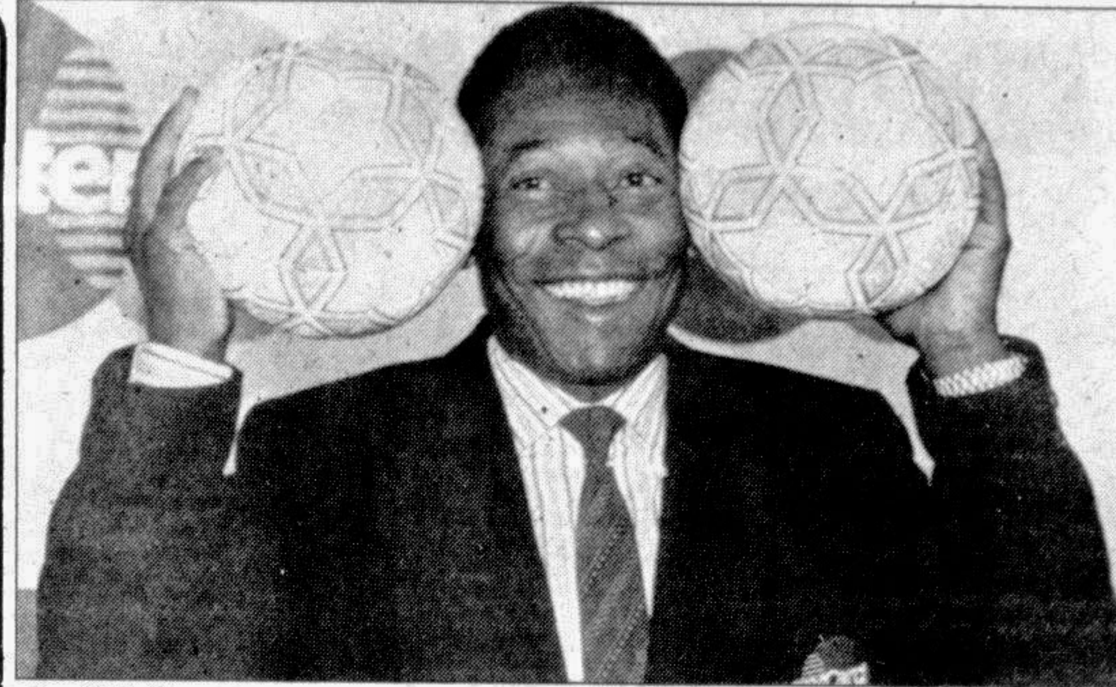
An AFP file photo dated April 1, 1992 shows Pelé posing with two footballs during a promotional tour. Brazilian President-elect Fernando Henrique Cardoso announced his cabinet on Dec 22. Pelé was made a Sports Minister.