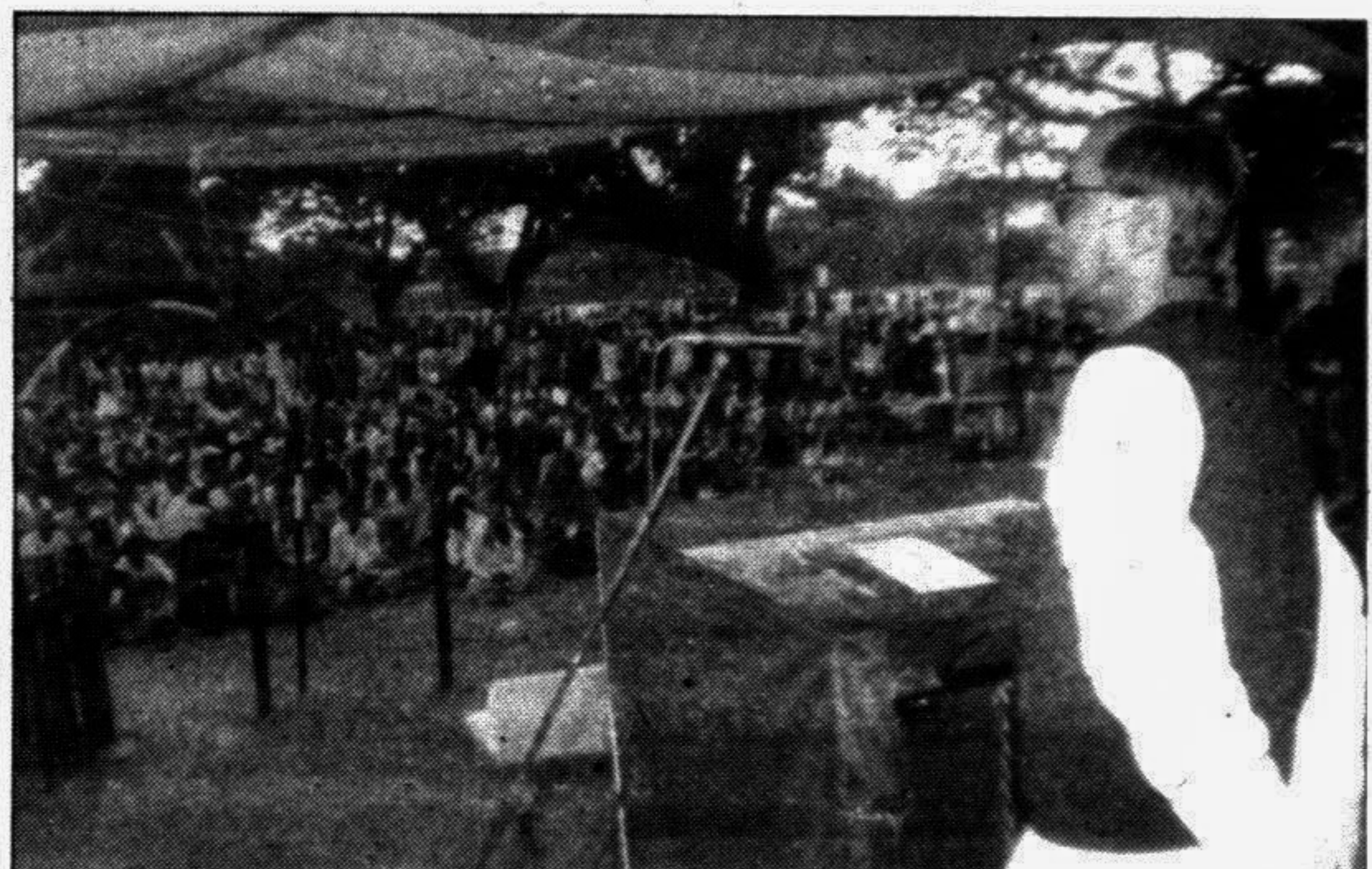
PABNA: The General Secretary, Bangladesh Workers Party, Rashed Khan Menon addressing as chief guest the inaugural session of the two-day central council meeting of the Jatiya Krishak Samity held recently at the Paksey Railway Institute premises.

The conference passed resolutions for distribution of entire agricultural land to the tillers who were the real producers in the agricultural sector. Resolution opposed abse-