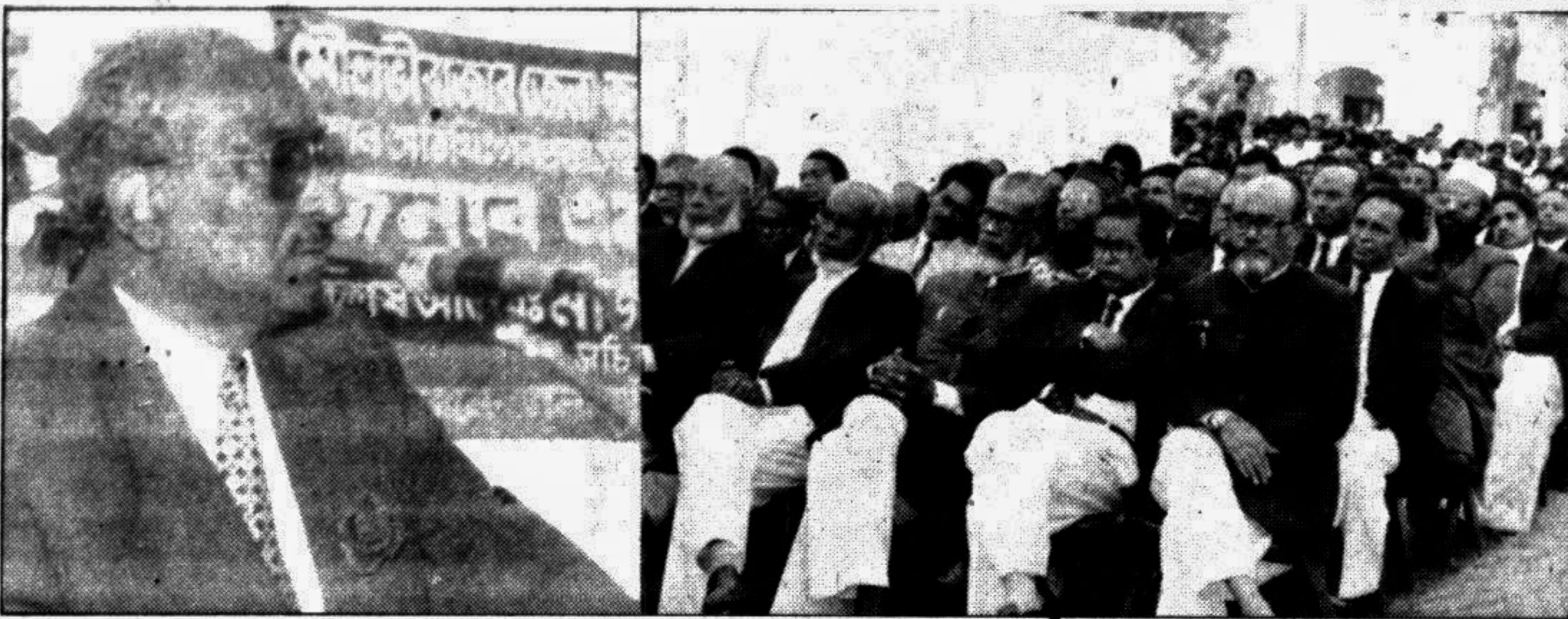
MOULVIBAZAR: Finance Minister, M Saifur Rahman, addressing the inaugural function of the Moulvibazar District Judge court building, which was held recently at the old District Collectorate compound.

Local administration has arranged to send the statue to the National Museum in Dhaka.