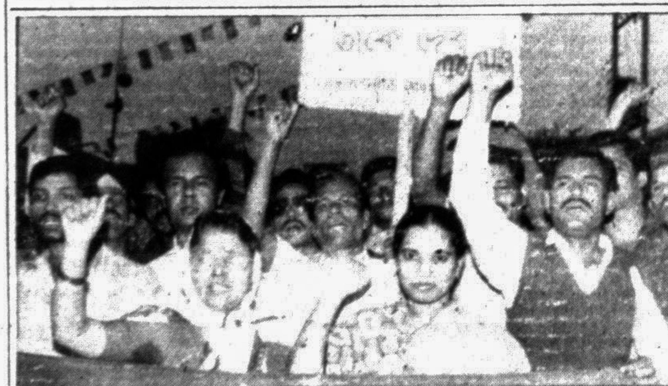
Supporters of the Awami League brought out a procession in the city yesterday in support of today's 6 am-12 noon road-rail barricade programme a success.

The Mayor said a community centre and a play ground would also be set up in the area.