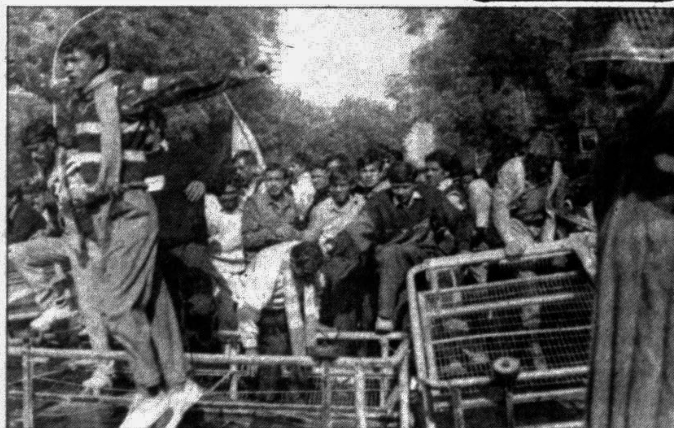
Supporters of a campaign to carve out a new state in northern India break through barricades in a bid to march towards the Parliament building yesterday, police used water cannons and arrested hundreds of supporters of the campaign for the new state, to be called Uttarakhand.