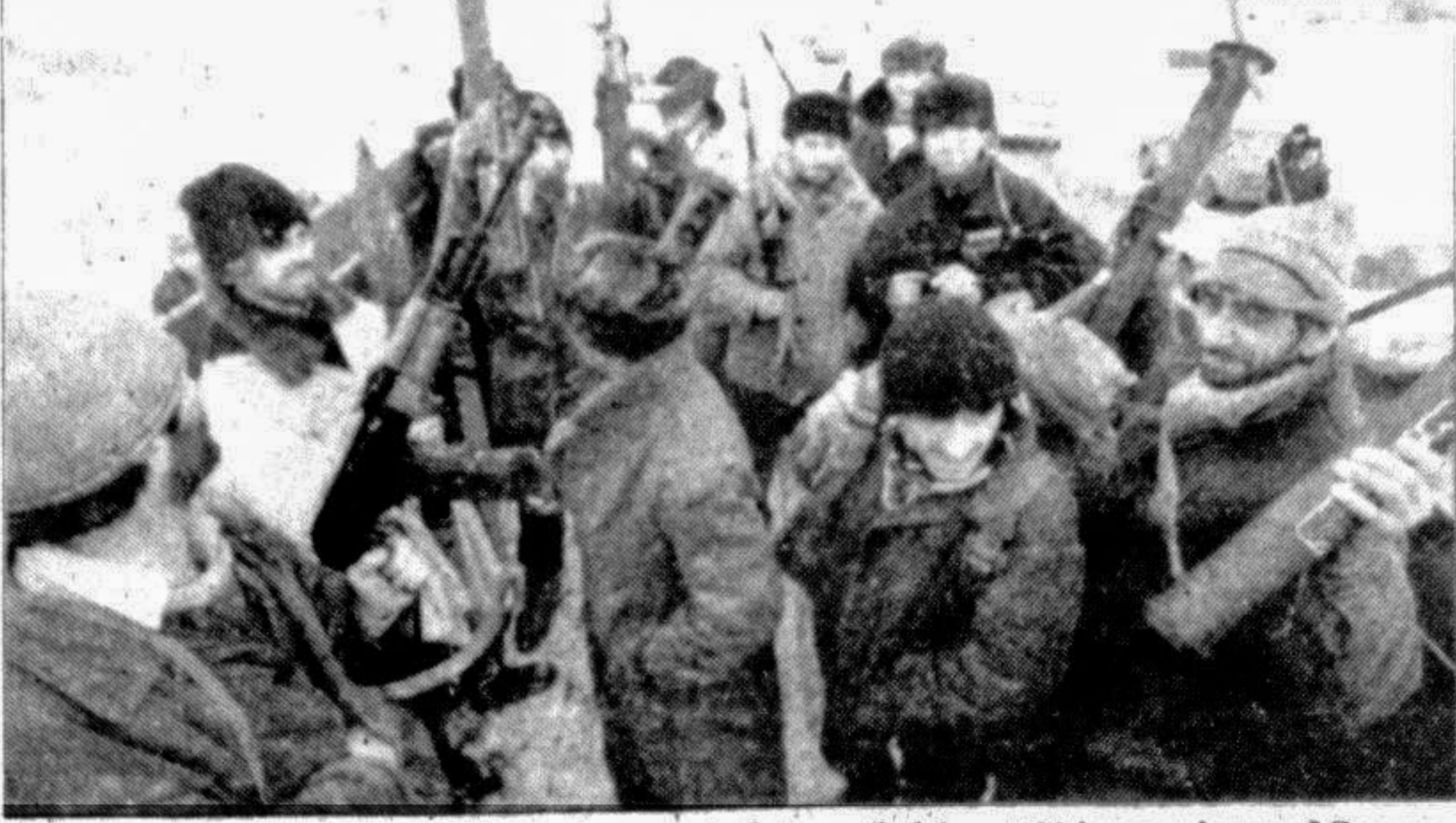
Chechen volunteers load a truck on the way to Petropavlovskaya (20 km northeast of Grozny) yesterday, where heavy combats have taken place during the last few days. Rebel Chechen leader Dzhokhar Dudayev called yesterday for international pressure on Moscow to halt its offensive on his breakaway Muslim republic but Russian troops pursued their attack.

From Page 1 Col 4. Secretary General and LGRD and Cooperatives Minister Abdus Salam Talukder. Communication Minister Lt Col (ret) Oli Ahmed, BB, who is Chief Adviser of the Jatiyatabadi Muktiyoddha Dal, was the main speaker. Without naming the Awami League, the prime minister said they were proceeding to establish democracy and the spirit of liberation war by joining hands with the anti-liberation force and the autocracy. 'Those on their right cannot be friends of liberation movement,' she said indicating Jamaat-e-Islami. 'Those on their left cannot be friends of democracy,' she said meaning the Jatiya Party. Begum Zia accused the opposition of pushing the country towards a disaster and called upon the freedom fighters to stand against those who want to enchain the country in slavery. 'It is time to safeguard the independence and sovereignty of the country,' she said. Turning to the problems of the freedom fighters, Begum Zia assured that the government would take sincere steps to assuage genuine grievances. She also assured contribution to the Freedom Fighters' Welfare fund created recently by the Jatiyatabadi Muktiyoddha Dal to assist the needy fellowmen. On rehabilitation demand of the freedom fighters, Begum Zia said preference would be given to assisting them in different self-employment projects. The Prime Minister urged the freedom fighters to portray the actual history of liberation war before the young generation.