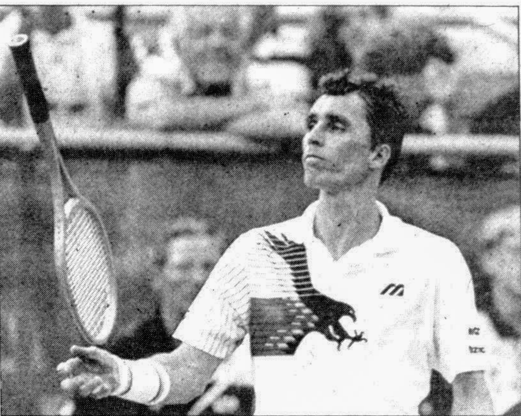
An AFP file photo dated Sept 5, 1990 shows Czech-born American tennis star Ivan Lendl flipping his racket during the US Open in Flushing Meadows. Lendl, who held the world number one spot for a record 270 weeks, announced the end of his career yesterday after a long-running battle with a back problem.

He particularly mentioned defenceman Alexei Kasatonov, who could seriously strengthen the Russian team at the world championships in Sweden in April and May. Finland's Seku Koivu scored the winning goal in the third-place game in the 20th second of overtime.