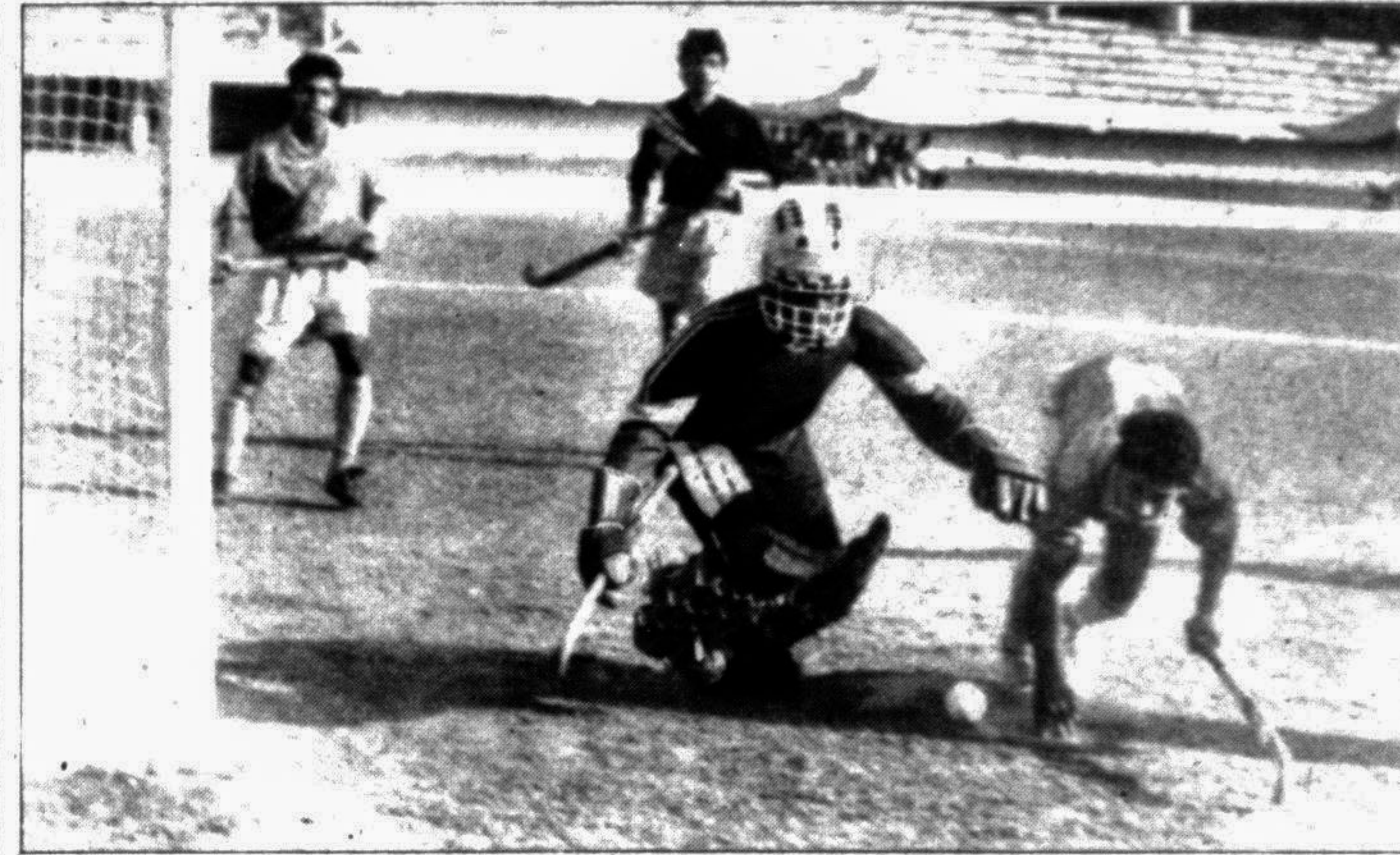
A goalmouth melee during the Green Delta First Division hockey encounter between holders Abahani Krira Chakra and Bachelors Club. The game ended in a goalless draw.

One hundred and seventy six shooters including twenty female participants will take part in ten events of the week-long meet.