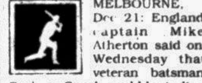
MELBOURNE, Dec 21: England captain Mike Atherton said on Wednesday that veteran batsman Graham Gooch could be in line to replace Alec Stewart as opener for the second Ashes Test against Australia, reports Reuter.

The tourists, trailing 1-0 in the five-Test series, are considering dropping vice-captain Stewart down the order.