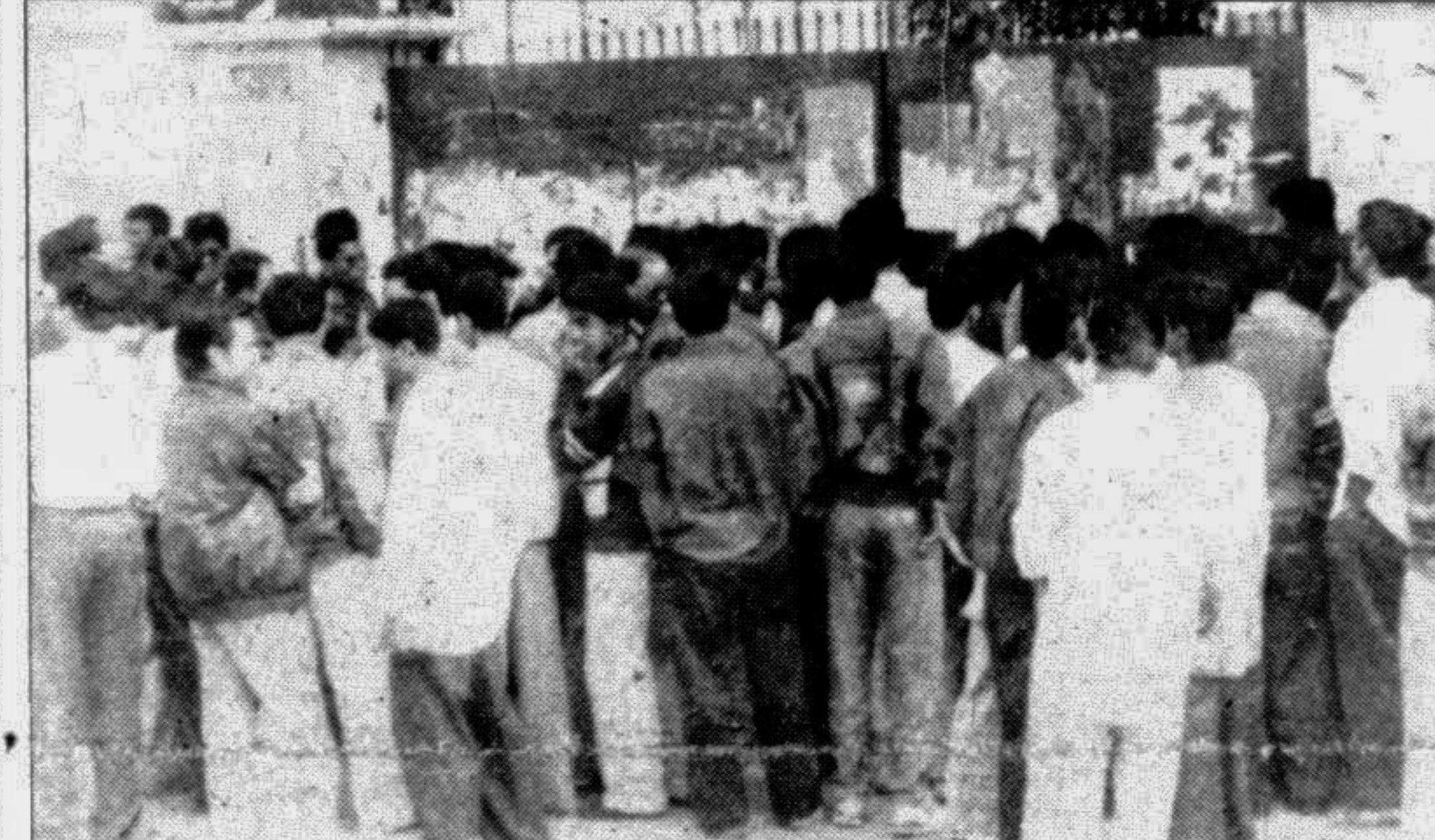
A large number of people gathered outside the main gate of the Badrunnessa Government Girls College in the city to get the HSC examination results of their wards yesterday.