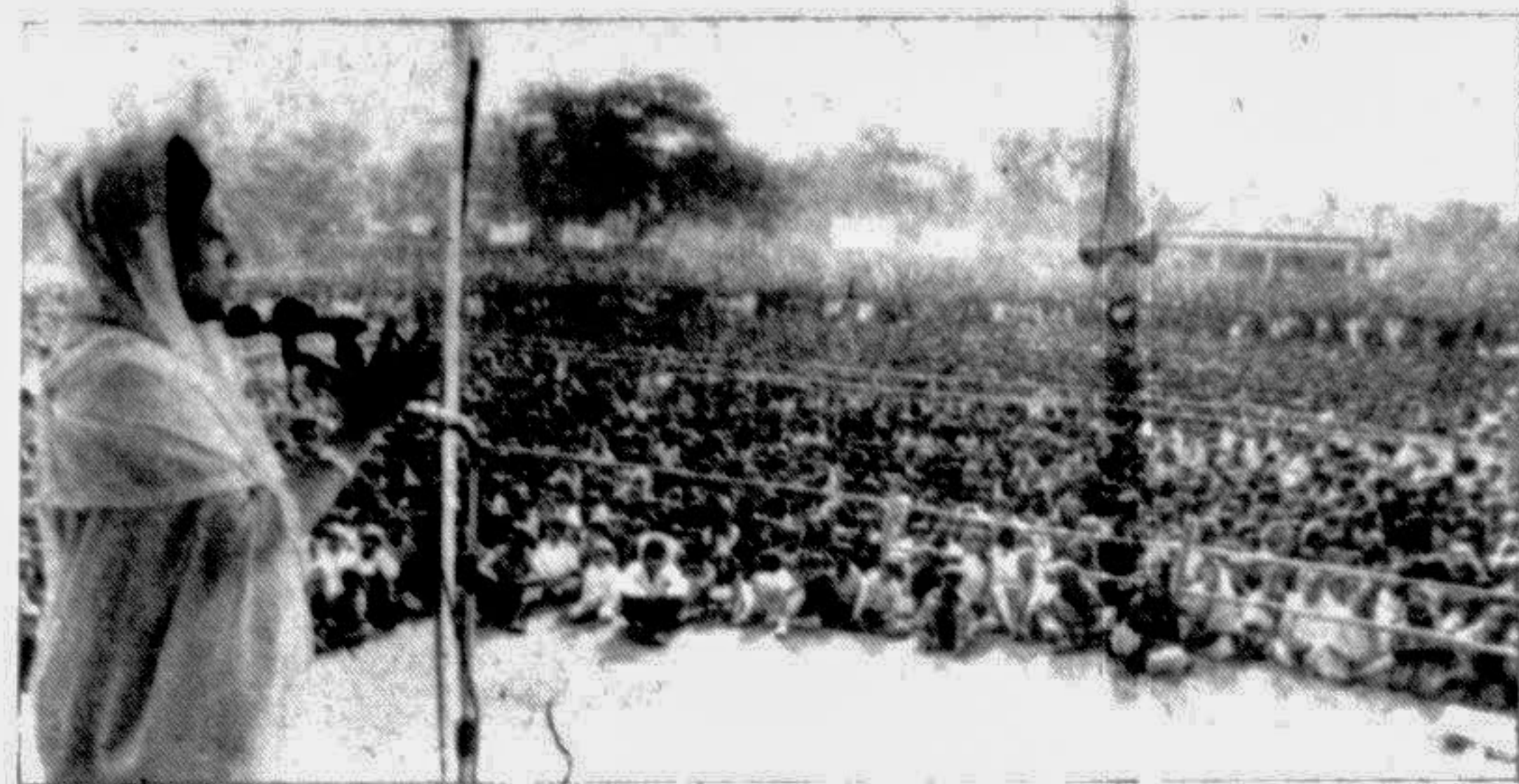
Prime Minister Begum Khaleda Zia addressing a public meeting at Maheshkhali in Cox's Bazar district yesterday.