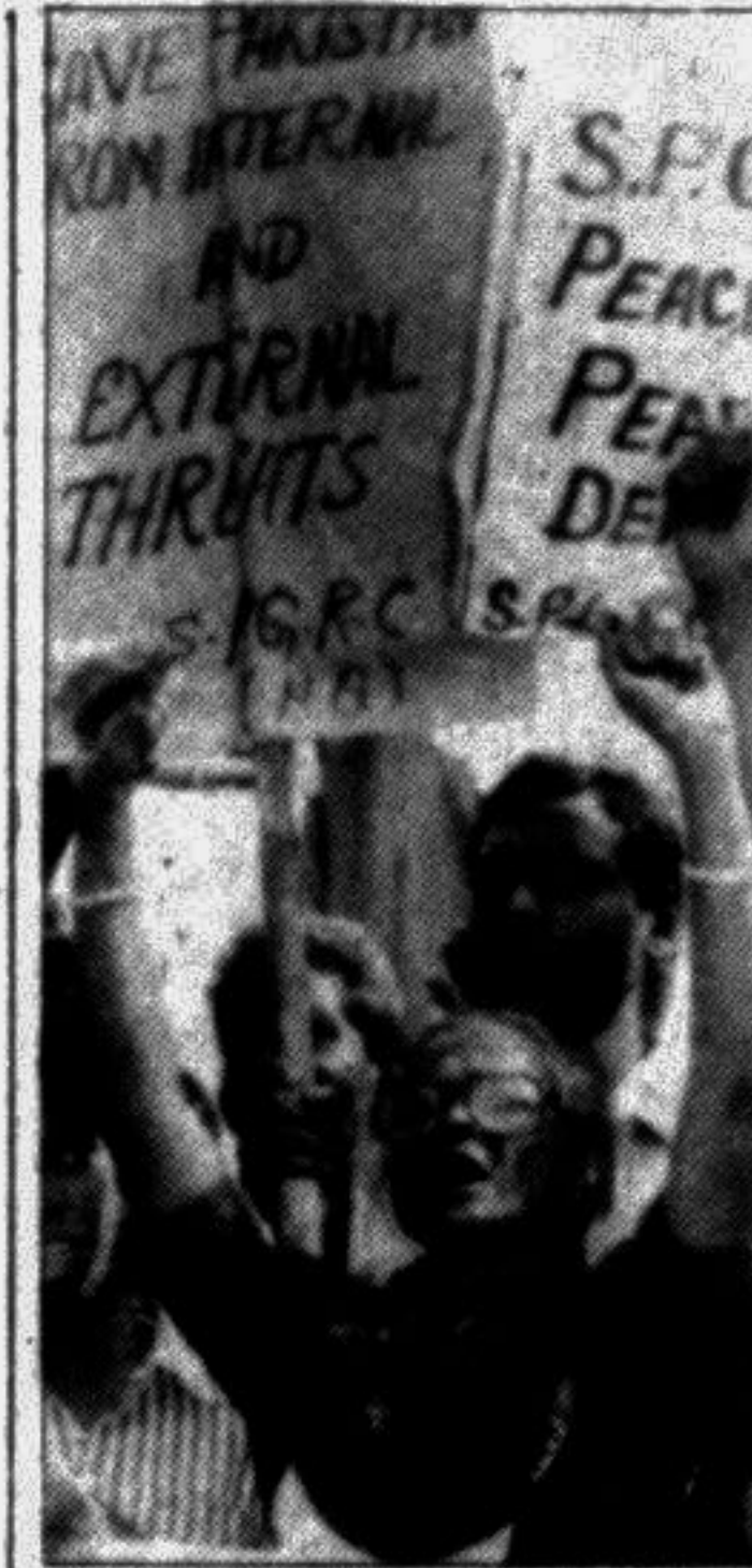
Stranded Pakistanis brought out a procession in the city yesterday demanding immediate repatriation.

The parishad announced the programme at a meeting held at its office tonight. The speakers at the meeting expressed concern at the 'unusual' delay in starting the functioning of the divisional headquarters.