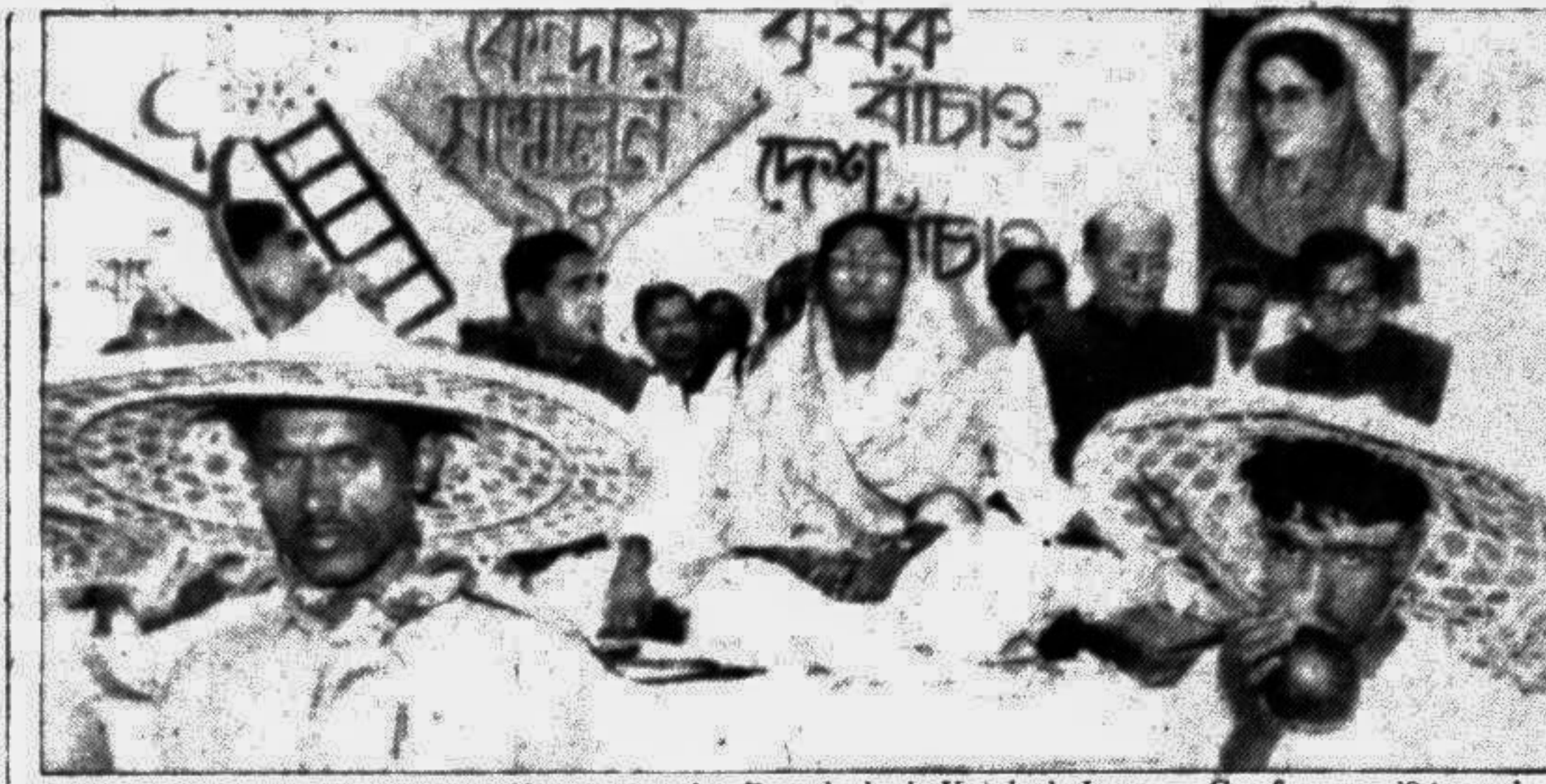
Awami League chief Sheikh Hasina at the Bangladesh Krishak League Conference '94 at Ramna Park in the city yesterday.

A case has been registered with the Kotwali police but no arrest has yet been made, police informed.