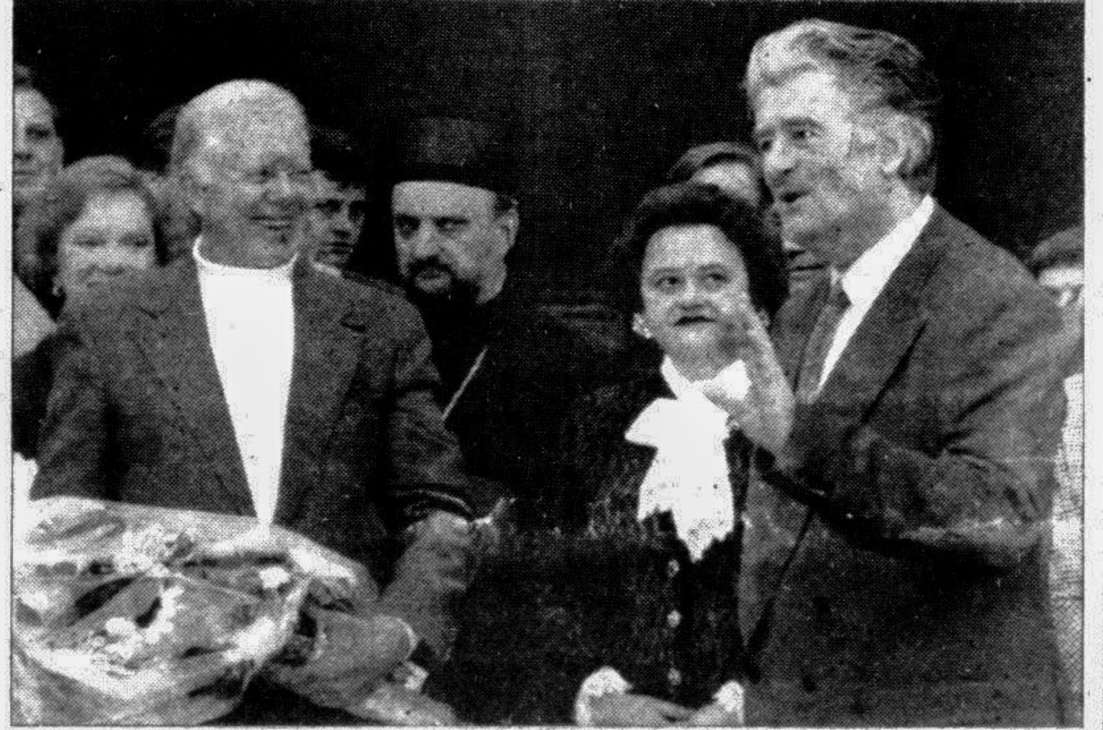
Former US president Jimmy Carter (L) smiles while listening to Bosnian Serb leader Radovan Karadzic (R) shortly before the start of their talks in Pale yesterday.