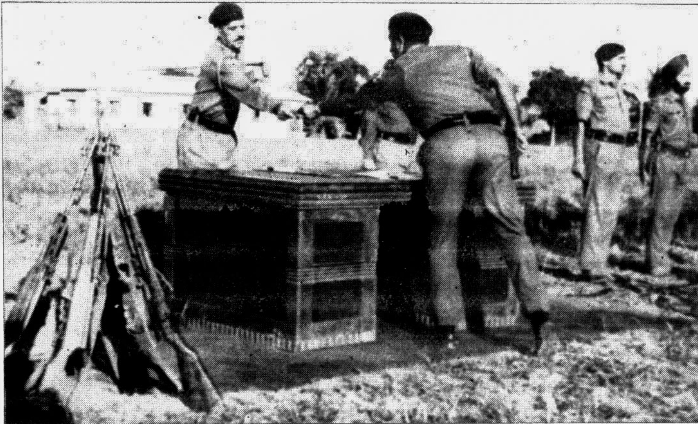
The Pakistani forces surrendered to the Allied Forces in Natore on December 18, 1971. On this day the defeated forces — Pak-Army laid down their arms before the Indian Army officers of Dighapata camp.