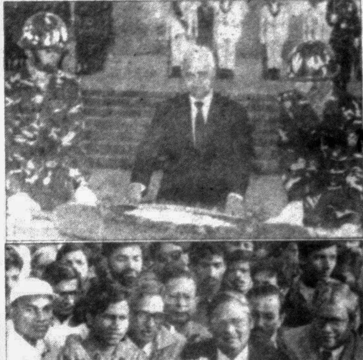
Placing of wreaths at the National Memorial at Savar on the occasion of Victory Day Friday: (From top) President Abdur Rahman Biswas, Dhaka University Sector Commanders of the Liberation War, Bangla Academy, Jatiya Party, Left Democratic Front and the Shilpakala Academy.

Meanwhile, the students at a rally at the TSC roadcrossing criticised the university authorities.