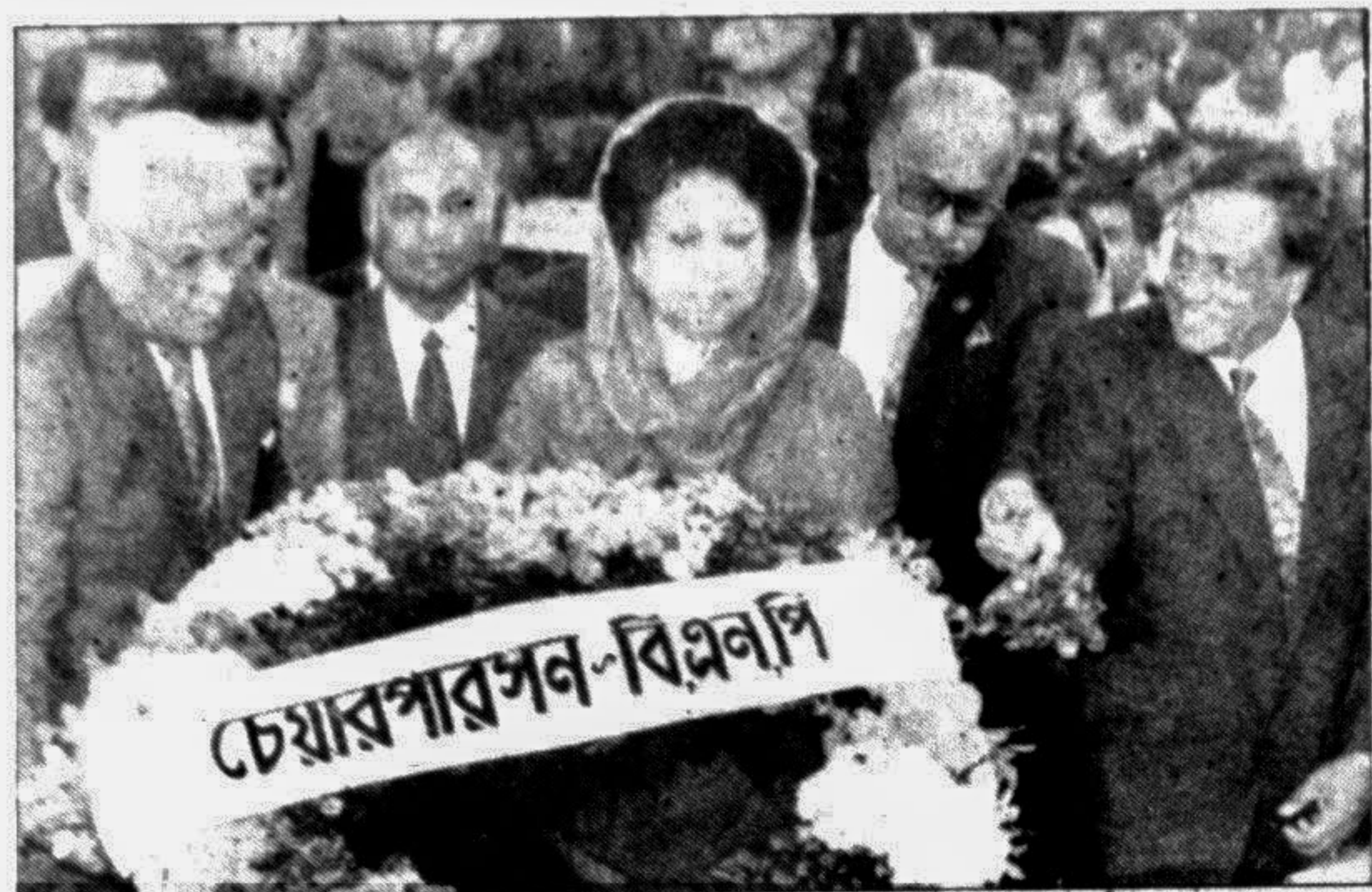
Prime Minister and BNP chairperson Begum Khaleda Zia and senior party leaders placing wreath at the National Memorial at Savar Friday.