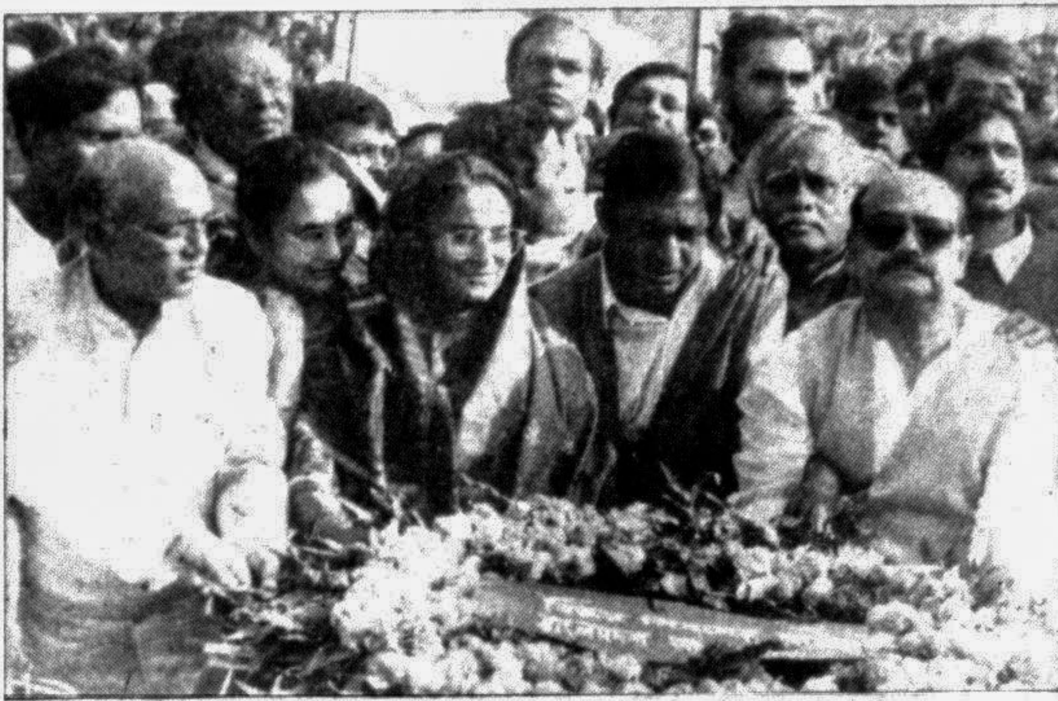
Awami League chief and Leader of the Opposition in Parliament Sheikh Hasina and senior party leaders laying wreath at the National Memorial at Savar Friday.

Some preliminary studies by these foreign companies have already started and they have received clearance for bringing survey ships and necessary equipment, a Petro-bangla source said.