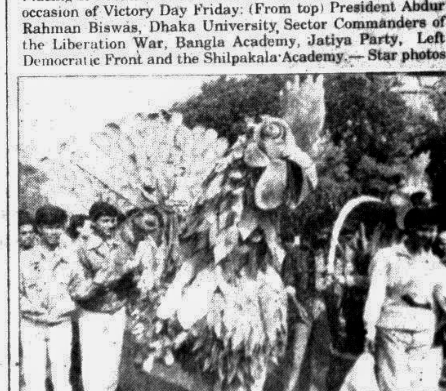
A colourful Victory Day procession by the Sammilita Sangskritik Jote Friday.