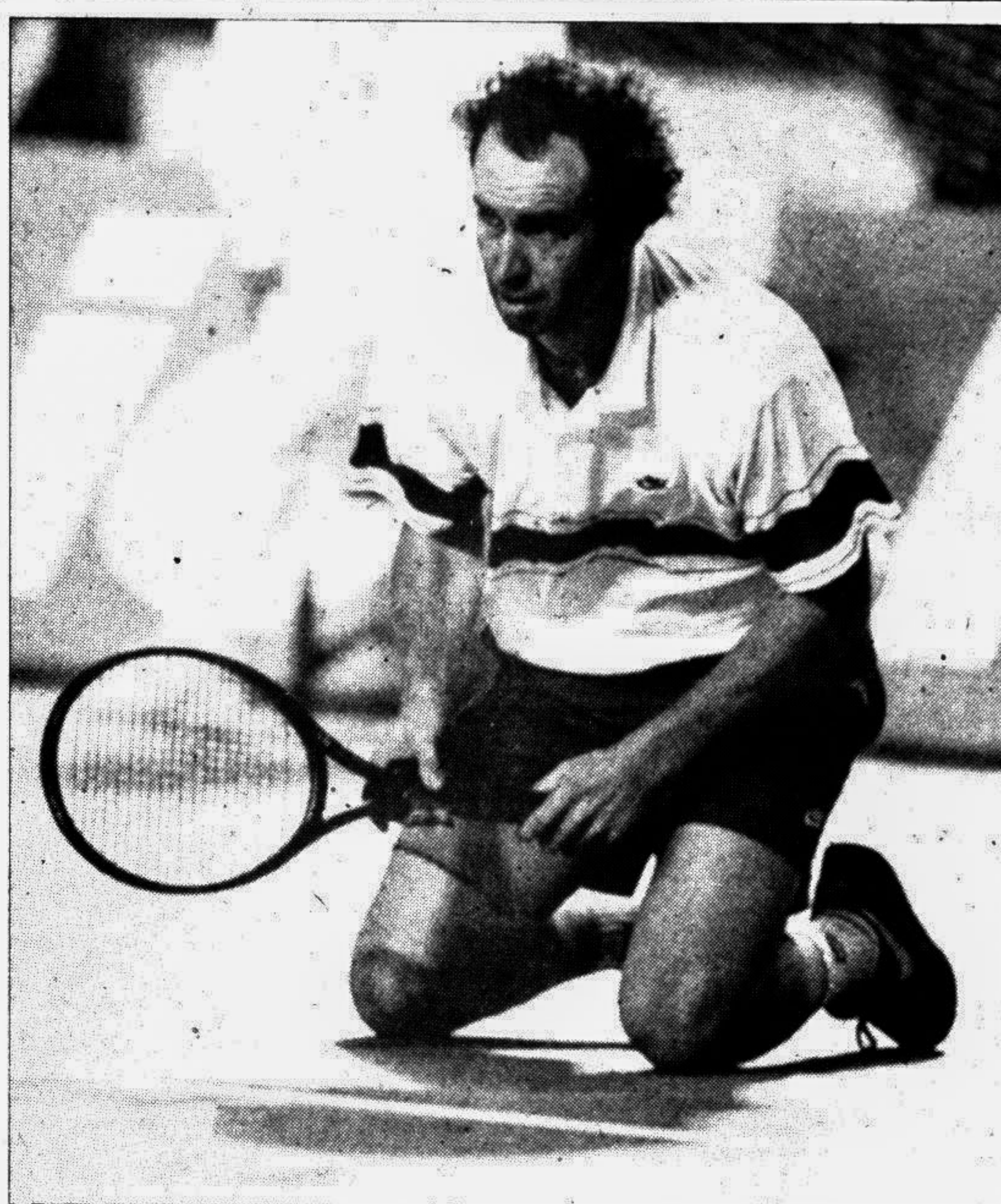
American tennis legend John McEnroe awaits the ball on his knees in an exhibition of his familiar on-court antics after one of many disagreements with the umpire in an exhibition match against compatriot Michael Chang in Hong Kong on Dec 16. Chang won 6-0, 7-5.