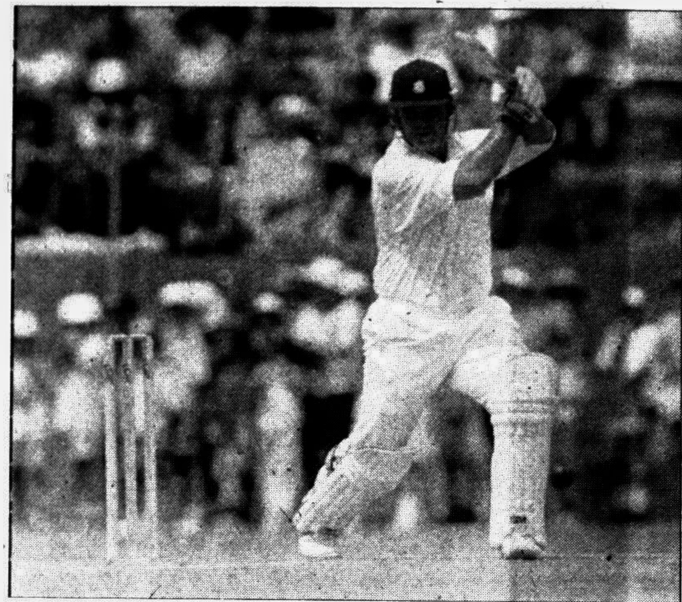
England batsman Mike Gatting drives one to the cover fence during his superb unbeaten knock of 114 against Queensland Bulls at the Neritige Oval in Toowoomba yesterday.