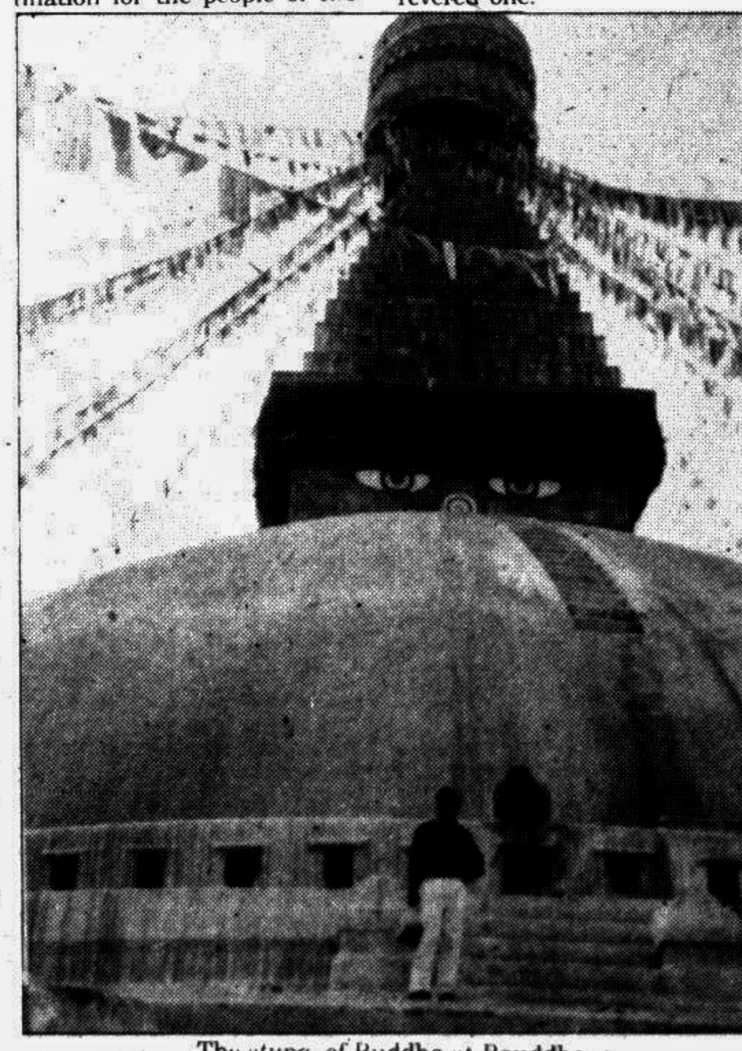
The stupa of Buddha at Baudha

religious faiths. As the only Hindu Kingdom with constitutional Hindu Monarch, it is the centre of religious faith for the Hindus. The temple of Lord Pashupatinath, the greatest of the Hindu Gods, on the bank of Holy Bagmati River in Kathmandu is the most revered one.