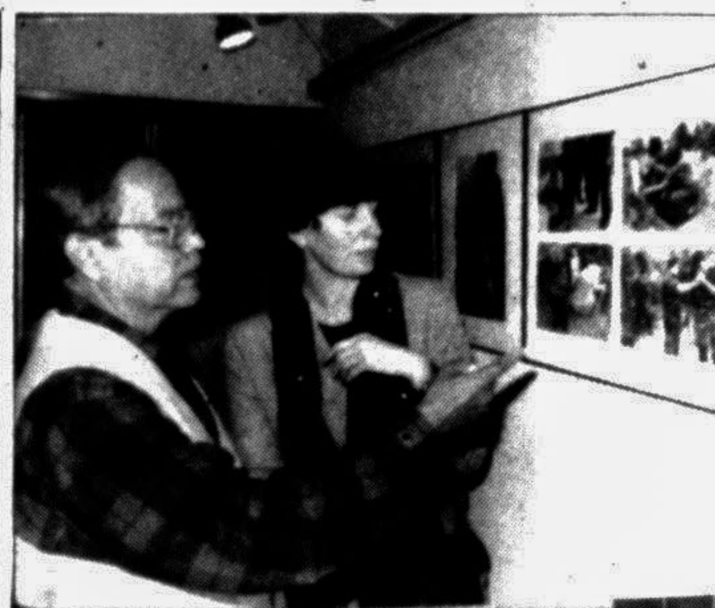
Deputy Leader of the House Prof A Q M Badruddoza Chowdhury looking at a photo after opening the 18-day long World Press Photo Exhibition at city's Drik Gallery yesterday. The show will remain open from 3 pm to 8 pm everyday till January 5.