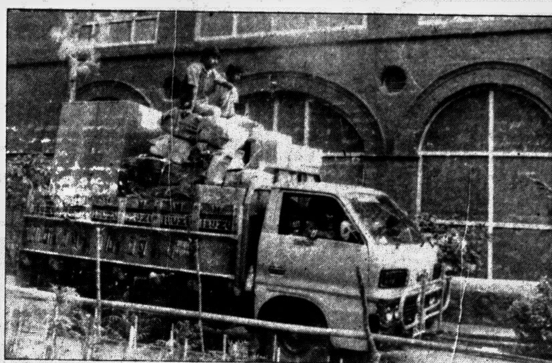
A truck-load of furniture and household effects being carted away from Leader of the Opposition Sheikh Hasina's official residence at 29, Minto Road in the city yesterday.

By Staff Correspondent The Karnaphuli Fertiliser Factory (KAFCO), the 450 million US dollar multinational joint venture, started trial production yesterday. A statement issued by the KAFCO office in the city yesterday.