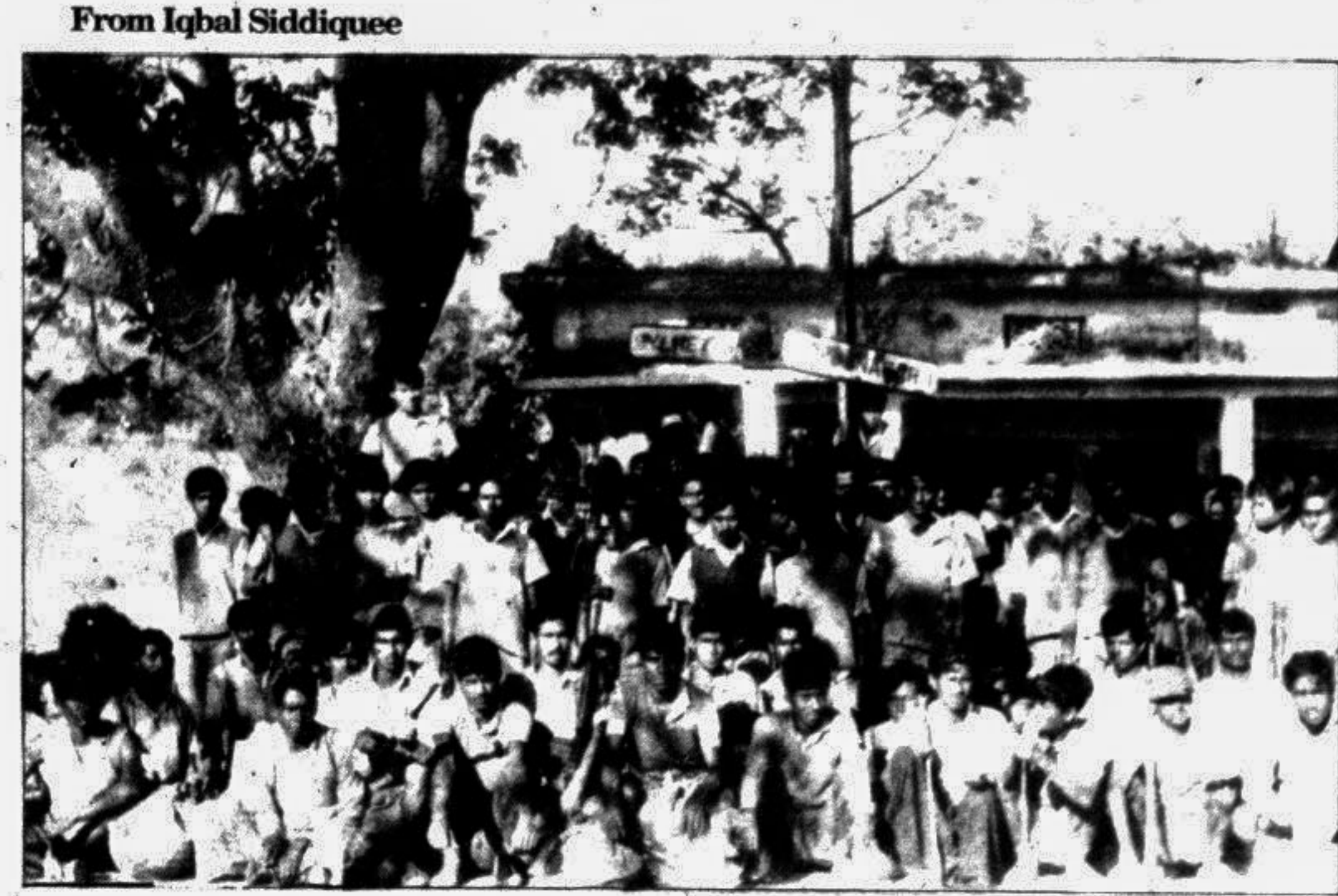
The muktibahini or Freedom Fighters at Chiknagul of Sylhet pose for a picture with the local people just before their attack on the enemy forces in Sylhet town.

Freedom Fighters. The Muktibahini and Allied forces, achieved great success in different important points causing serious losses to the enemy forces. They became worried with the fall of some important bases at different sectors. In such a situation, the Pak Army launched air attacks. Avoiding the air strikes a big contingent of the Muktibahini and Indian Army reached at the Khadimnagar area, about five miles from the Sylhet town on December 13. By this time, two other contingents of the Muktibahini captured Jalalpur and Lamakazi, in southwestern side of the town. It almost crippled the Pak Army as there was no scope to move for them. Only the northern side was then open. But it was also quite unfortunate for them that, this open area was also full of hillocks and next to which was the In-