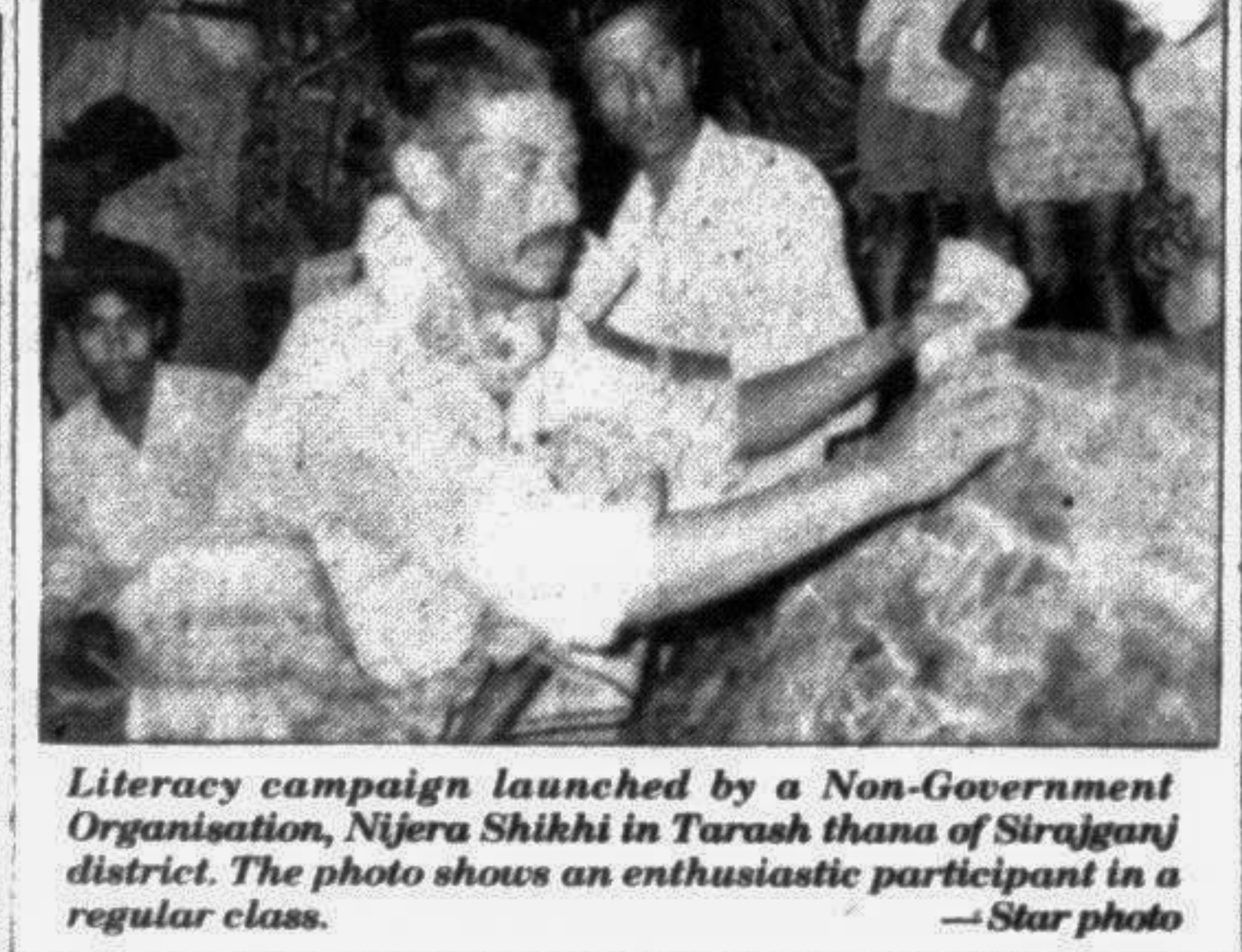
Literacy campaign launched by a Non-Government Organisation, Nijera Shikhi in Tarash thana of Sirajganj district. The photo shows an enthusiastic participant in a regular class.