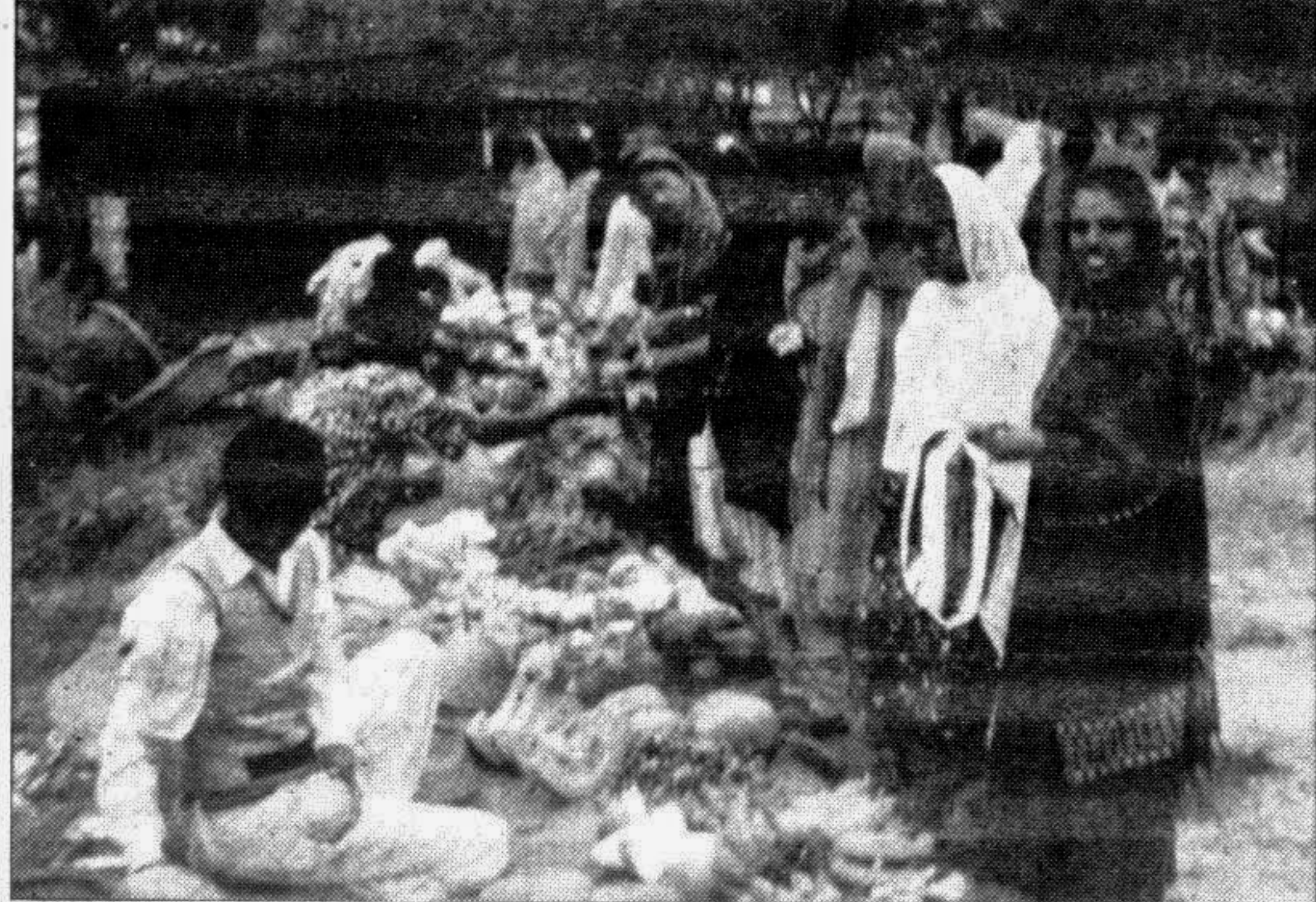
RAJSHAHI UNIVERSITY: A 'khancha bazar' only for ladies. All kinds of vegetable like papaya, banana, pumpkin are available here. It starts in the early morning and continues upto 9.00 pm everyday. It is situated in front of Begum Rokeya and Taposy Rabeya hall of the campus.