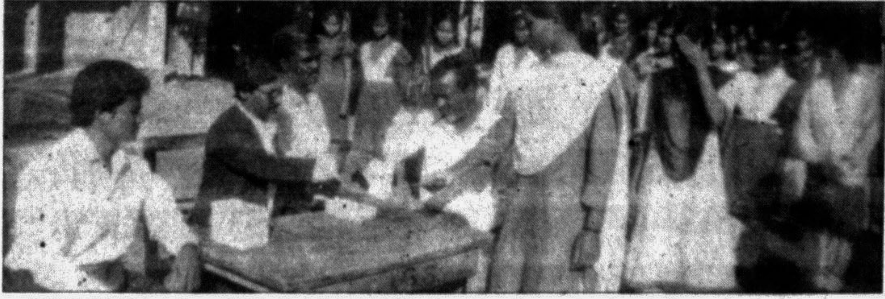
KURIGRAM: Girl students of Kathalbari Girls High School receiving cheques of semi-stipend being distributed by Rupali Bank branch in Kurigram.

possession creating panic in the area. Besides, incidents of theft and burglary are rampant in the residential and commercial areas of Kazipur and sadar thanas. At least 50 incidents of dacoity or theft have taken place in these thanas in the last five months, the sources added.