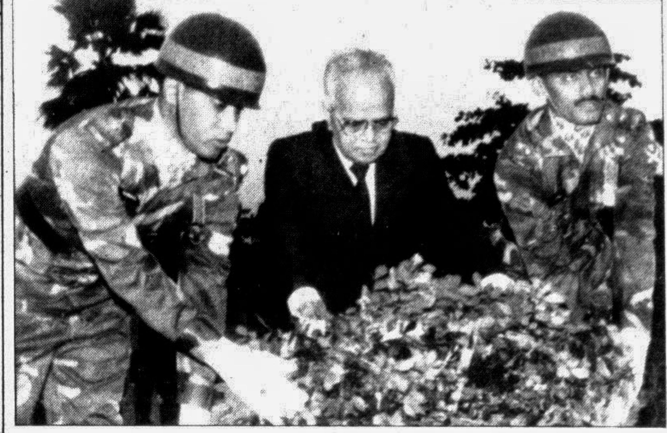
President Abdur Rahman Biswas placing wreaths at the Martyred Intellectuals Memorial at Mirpur in the city.