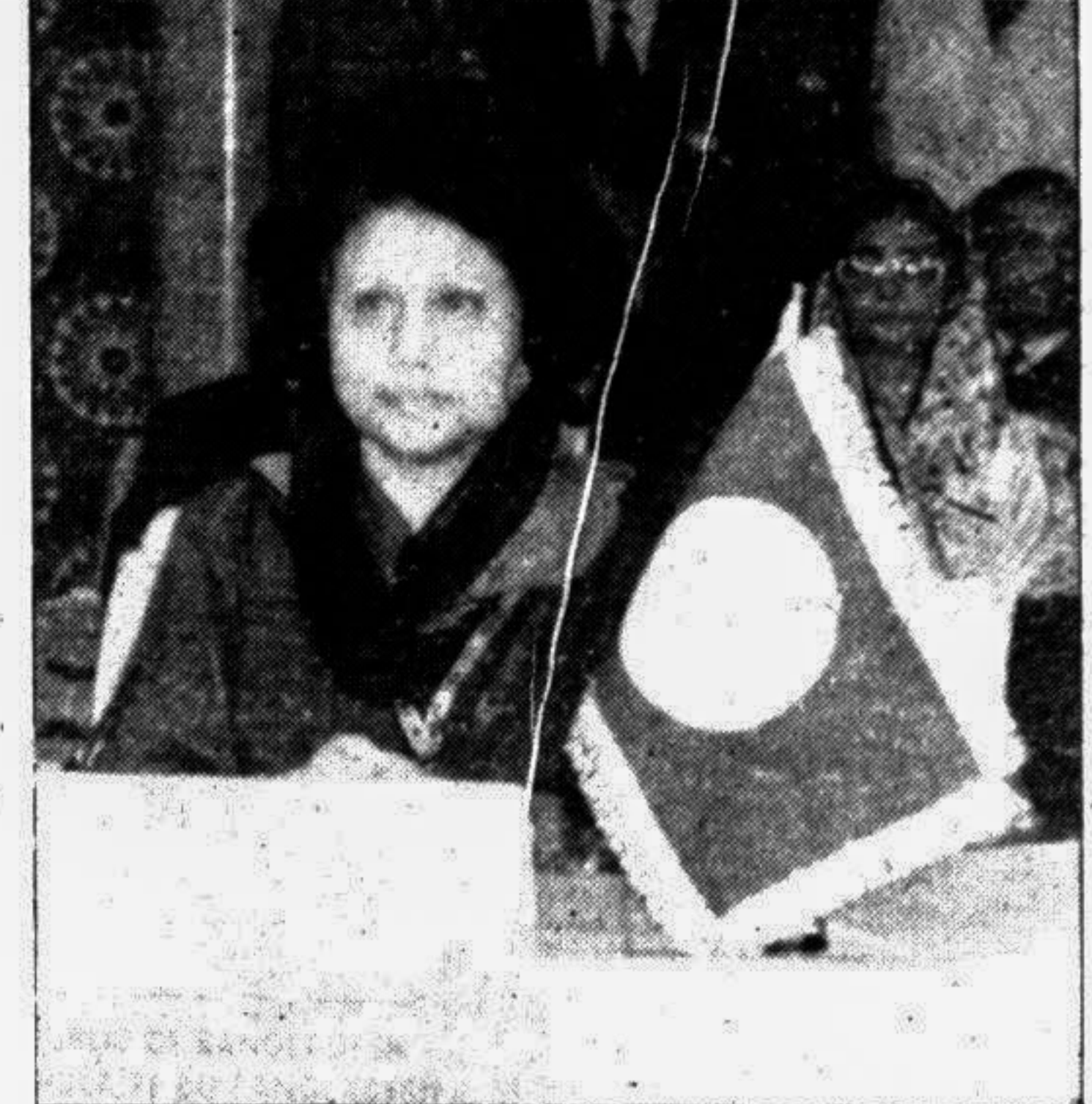
Prime Minister Begum Khaleda Zia attending the opening session of the Seventh OIC Summit at the Royal Palace in Casablanca, Morocco Tuesday.