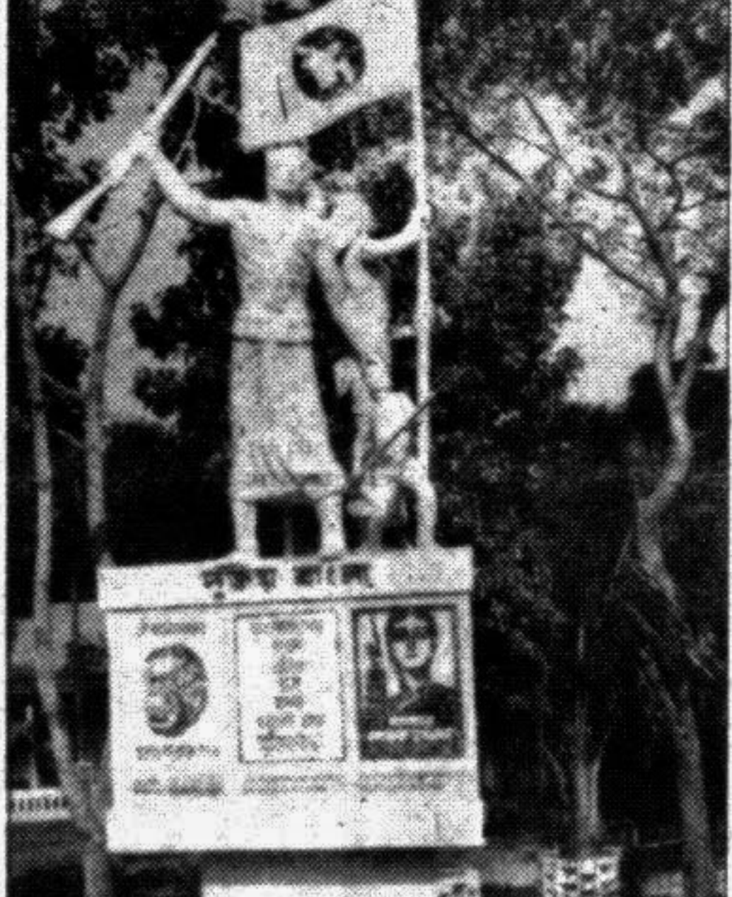
SIRAJGANJ — 'Duryaj Bangla' a monument on Liberation War at Chandidash-ganti in Sirajganj awaits formal opening.