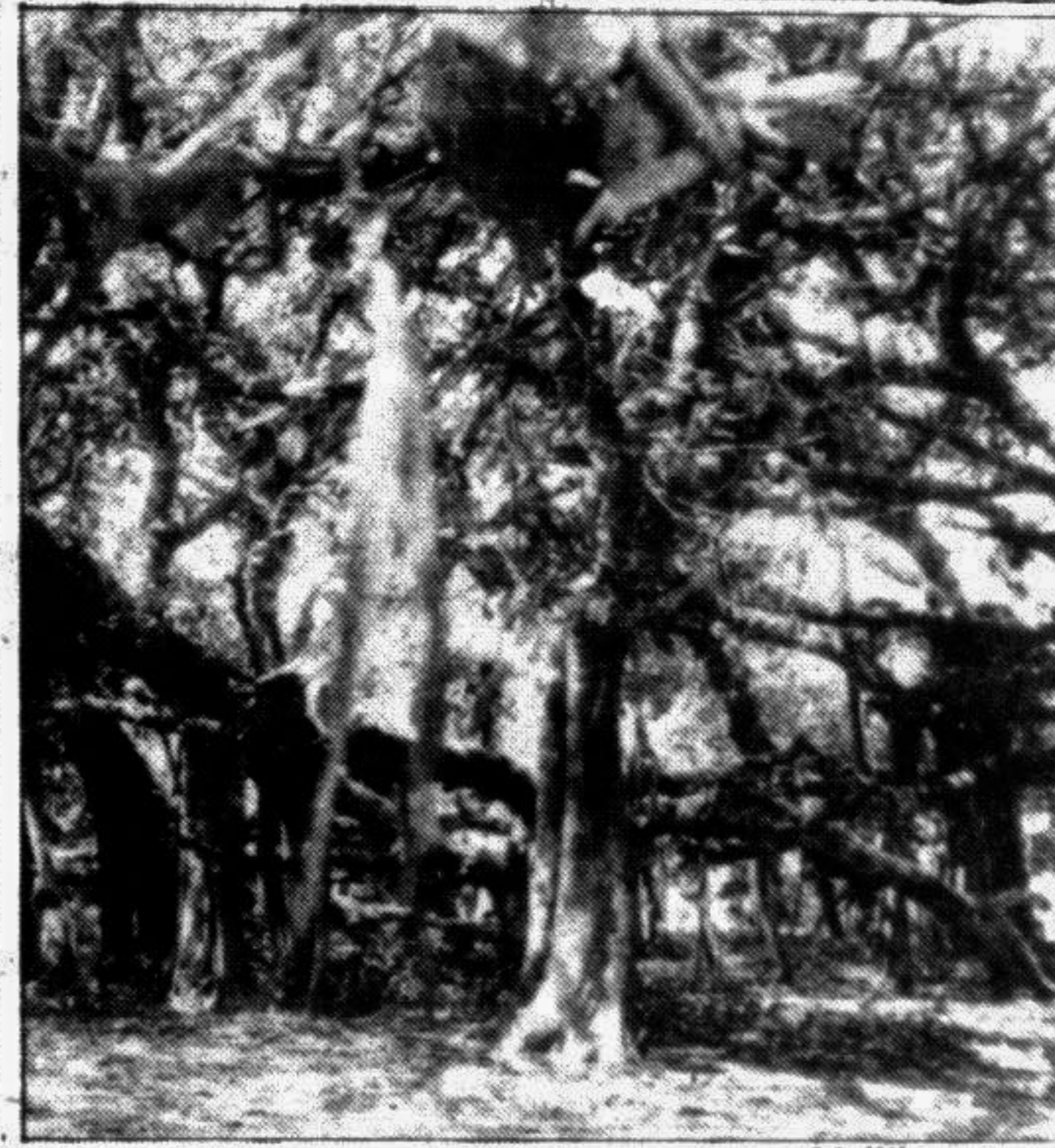
JHENIDAH: The centuries old Banyan tree at Mallikpur