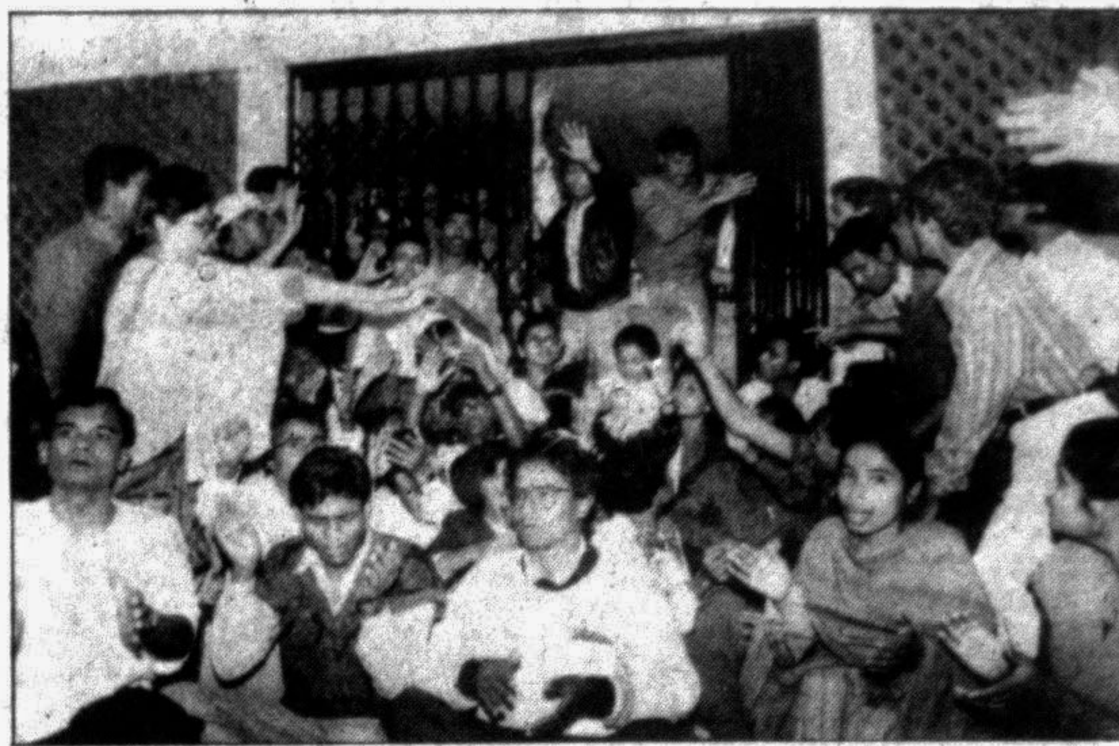
Students of the Dhaka University demonstrating in front of the office of vice chancellor yesterday for shifting the Honours and Master degree examinations.