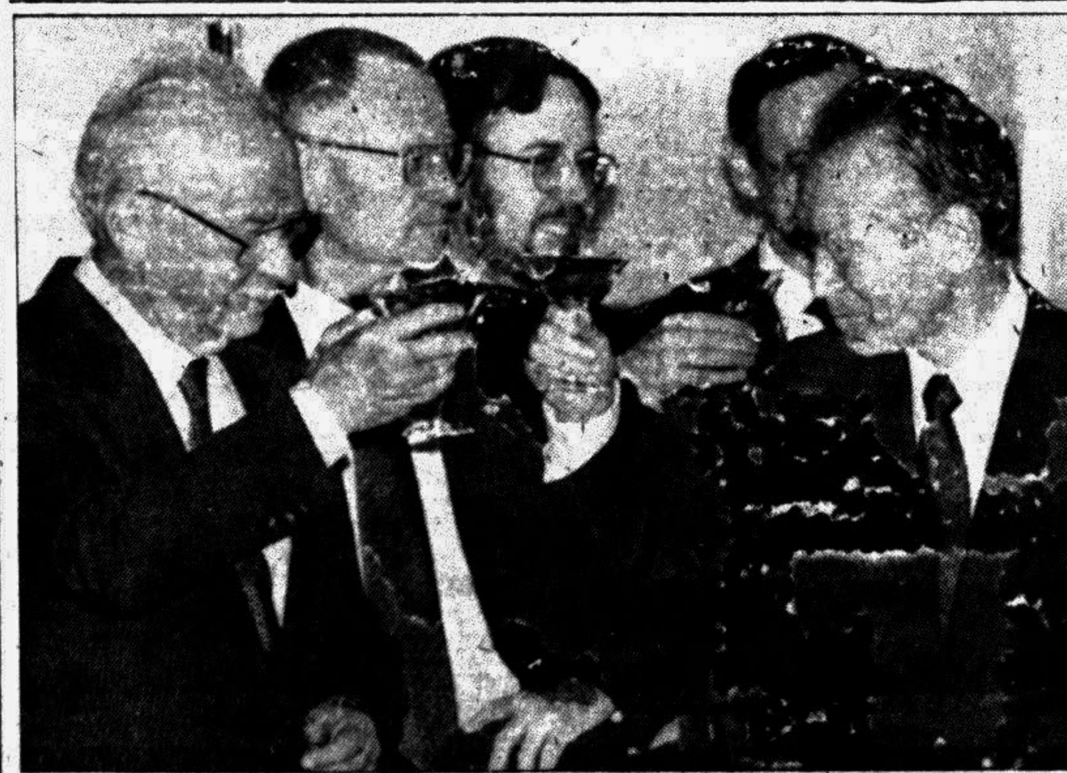
Israeli Prime Minister Yitzhak Rabin (L) toasts with his Japanese counterpart Tomiichi Murayama (R) after signing a treaty on science and technology cooperation at the Akasaka state guesthouse in Tokyo yesterday.

The president did not say when the ceasefire would take effect. A team of negotiators will be sent to the rebel stronghold of Jaffna to discuss the modalities, she said.