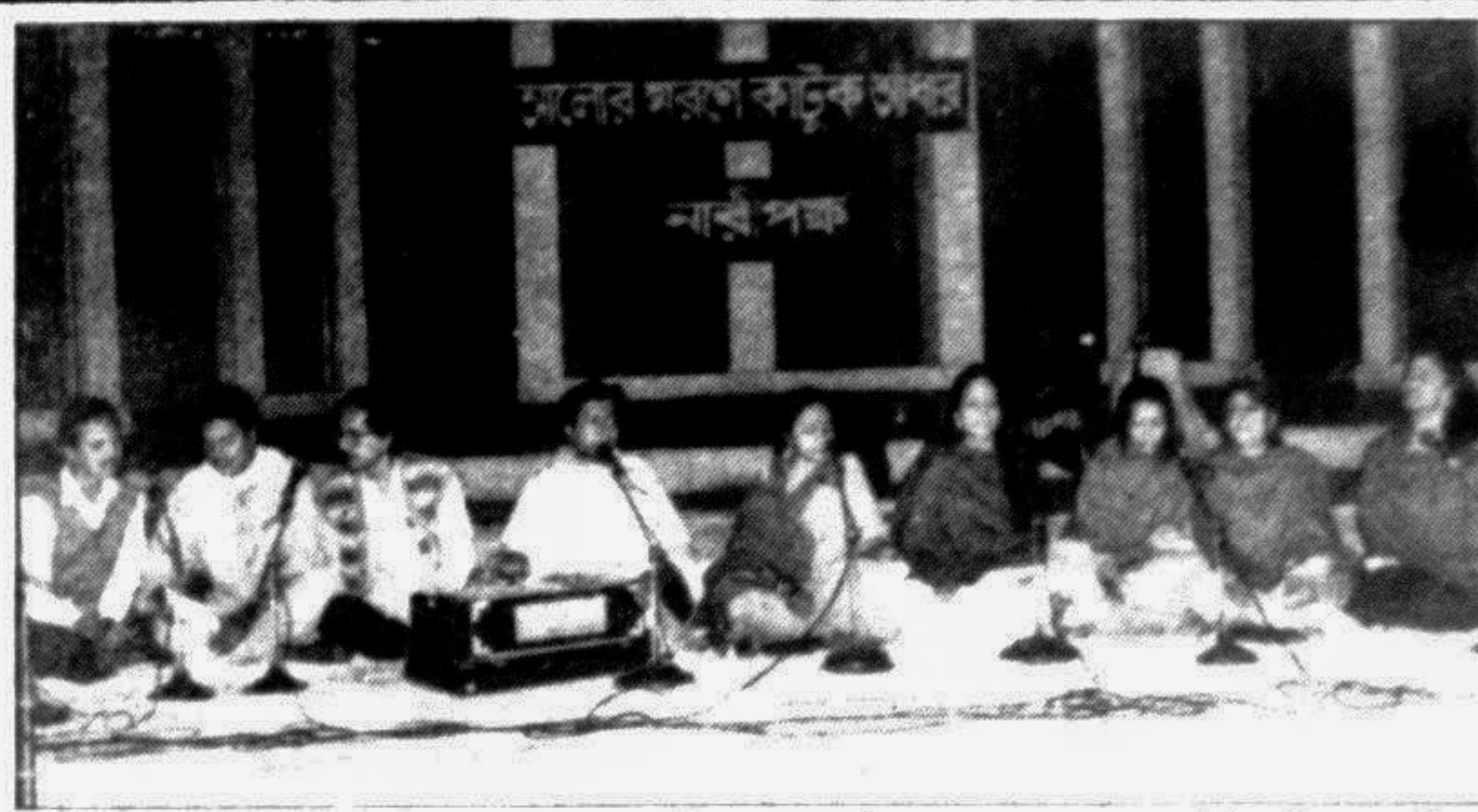
Artists presenting a chorus at the candlelit remembrance programme of the Naripakkha, a women organisation, at city's Kendriya Shaheed Minar premises yesterday.